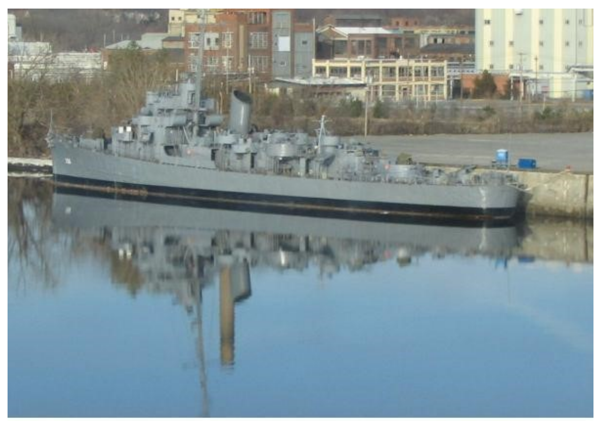
Waiting peacefully but eagerly for the move back to Albany.

Phone (518) 431-1943, Fax 432-1123 Vol. 9 no. 3, March 2006