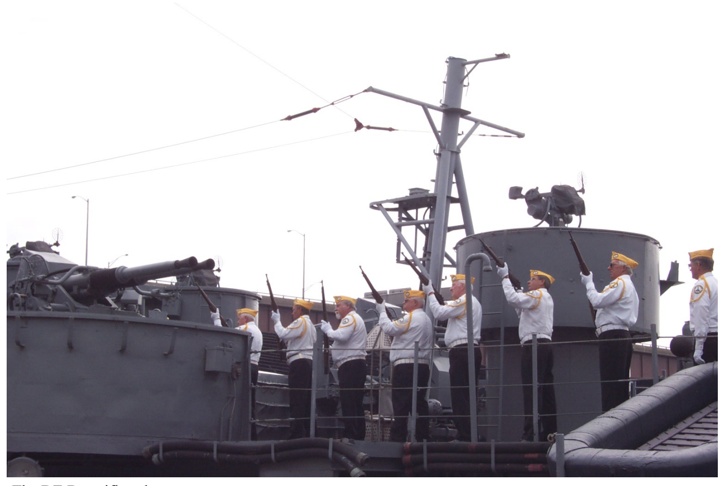
The DE Day rifle salute.