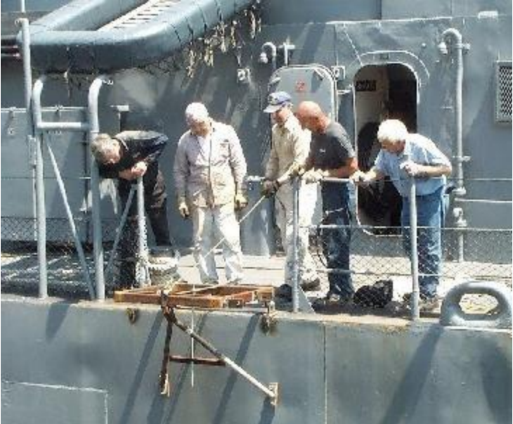
Unloading the K Gun from Fall River.