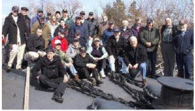
The returning Guides pose of the focs'cle.