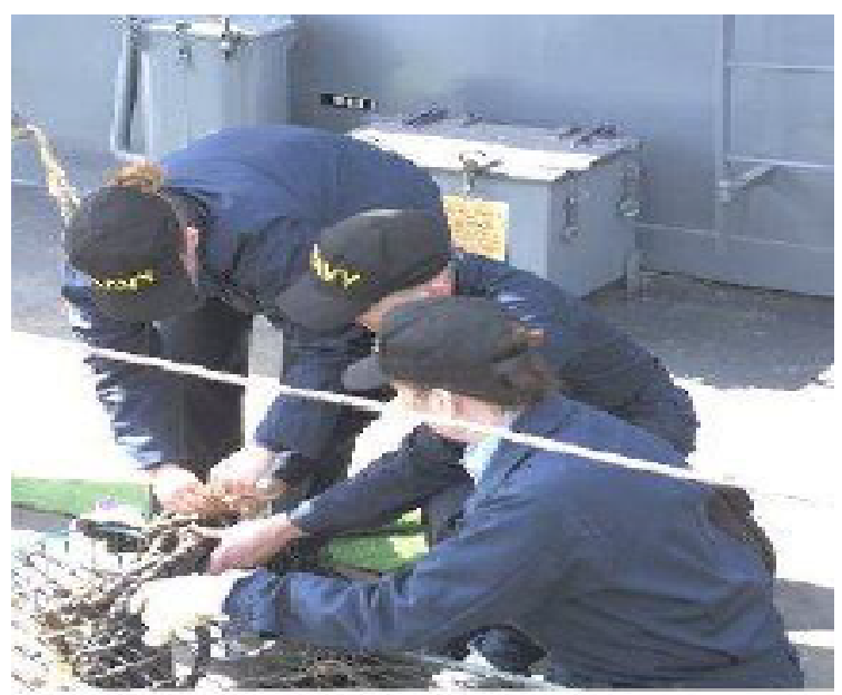
Naval Reservists from the Albany Reserve Center stowing at water agitators for the season.