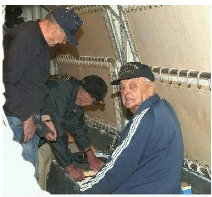
The Michigan crew working on locker tops in the Museum Space.

It was a great two weeks for all hands. It's a small step forward, but if the crew stays as fired up as that engine was, this old girl just might move again one day. The big problem now is to find some funding for the project so they can have a source of parts, as they get deeper into the overhaul. It would be appropriate at this point to get into some of the philosophical reasons for getting into the engine work. Our primary mission is the preservation of the USS SLATER and her technology as a historic artifact to serve as an educational tool. Operating SLATER under her own power, for many, may not seem practical and feasible for our small organization. We won't know that until we get further down the road. However, we view getting the equipment in operating condition as an important part of the preservation process. Even if an engine is only run once a quarter to warm it up and then shut it down, that makes the difference between preserving an engine, or a frozen hunk of iron. Another reason for going down this road is that it brings life, people and activity onto some very cold dark places in the SLATER.