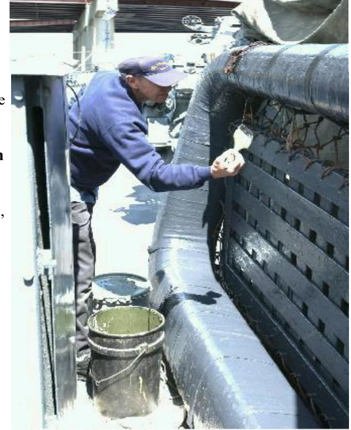
A life raft getting a final coat of paint.

But we could never shut the shop down long enough to make it happen. With the arrival of the Michigan crew, we threw their best men into the shop and said, "Don't come out till it's chipped." Ron Zarem, Tim Markham and Chuck Green went at it with needle guns. The first part of the process was pulling all the gear out of the shop. Looking at the mound of welding cable, air hose, tools, parts, equipment, scrap metal and safety gear on the deck outside the shop, one volunteer commented that it looked like the machine shop had barfed onto the weather deck. With the grinder, lathe, drill press and welding machines all covered over, the space was dismal. They chipped for four days and spent Friday patching and repairing the insulation. Chuck Green in particular really stayed on the job. This is rough work. So rough that Tim Markham decided it would be more fun to fix the commode. But he went back to chipping. Zarem seemed to spend a lot of time wandering around supervising