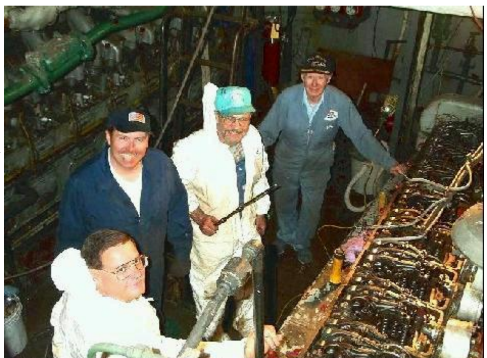
Slater Engineers working on the number two ship's service generator.

The one small bit progress we didn't address is what has been happening down in the engine room. The big bit of restoration news is that the engineers rolled Main Diesel number four, two complete revolutions on air. They got the HP air compressor and starting air system hydro tested and working. They got oil in the sump. They jacked the engine by hand, and opened all the cylinder cocks. They prelubed it. They built 450 pounds on the starting air cylinders and let her turn. They were hesitant to go further because they were concerned that the generator bearings weren't getting any