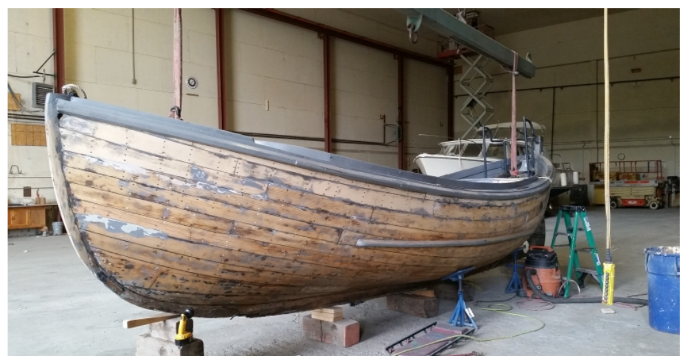
Progress on the whaleboat at Scarano's Boat Yard.