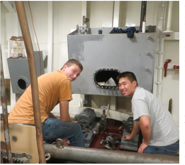
Work is progressing on the replica smoke generator.