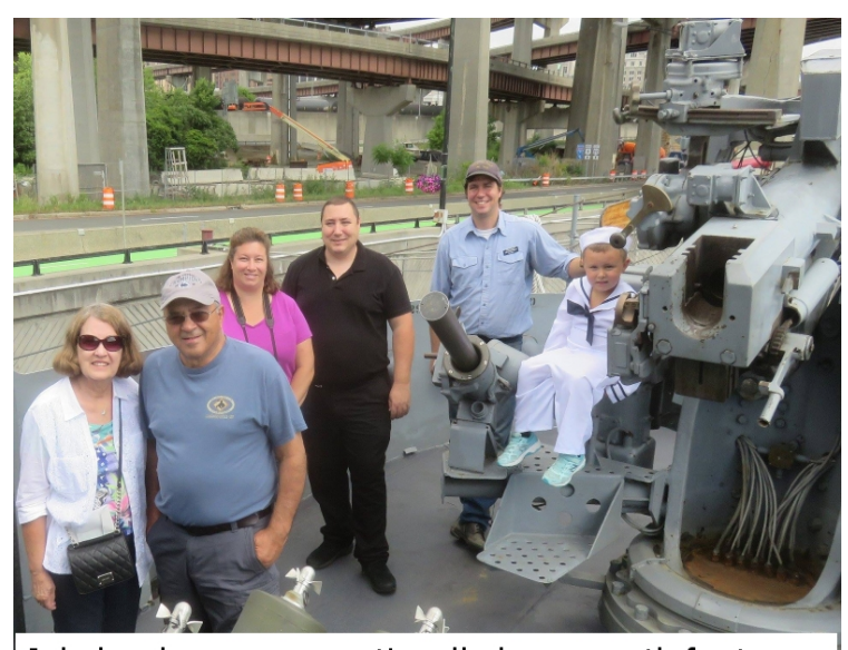
July has been an exceptionally busy month for tours.

We keep the current week's schedule as well as the next week's posted, so guides know what to expect the next time they are in. We also have announcements of upcoming events in the area, including the poster for our annual Volunteer Appreciation Dinner next month. We keep the intern's keys, chained with part of an old fishing trophy, to keep guides from accidently taking the keys home.