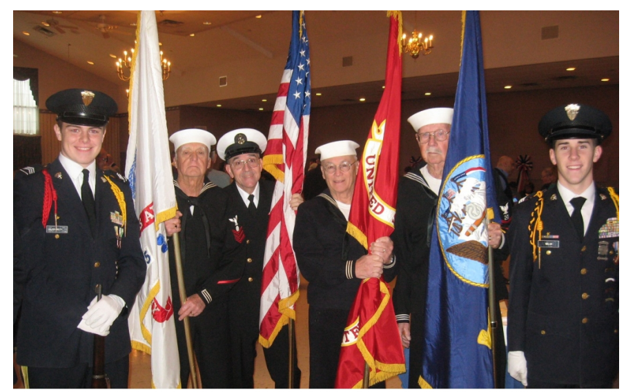
The SLATER Color Guard on Pearl Harbor Day.