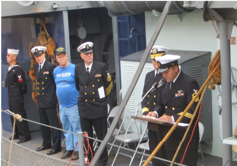
Our CPO Association celebrates the Navy Birthday.