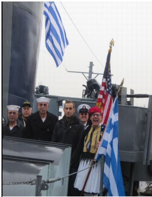
The Greek flag flew over the A/T AETOS on Oxi Day.

During the day, the Greek flag flew from the battle gaff, and our St. Nickolas icon was displayed on the quarterdeck during the commemoration. St. Nickolas is the "Protective Saint" of Hellenic Navy, Hellenic Merchant Marine, and Hellenic Coast Guard, and is celebrated each year by the Greek Marine community on the 6th of December, according to Greek Orthodox Church traditions.