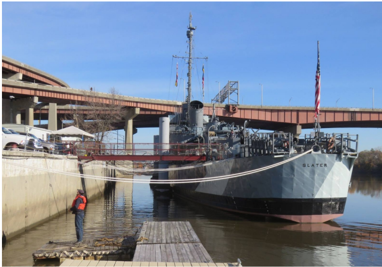
Stern view as the paint float is moved close to the sea wall.