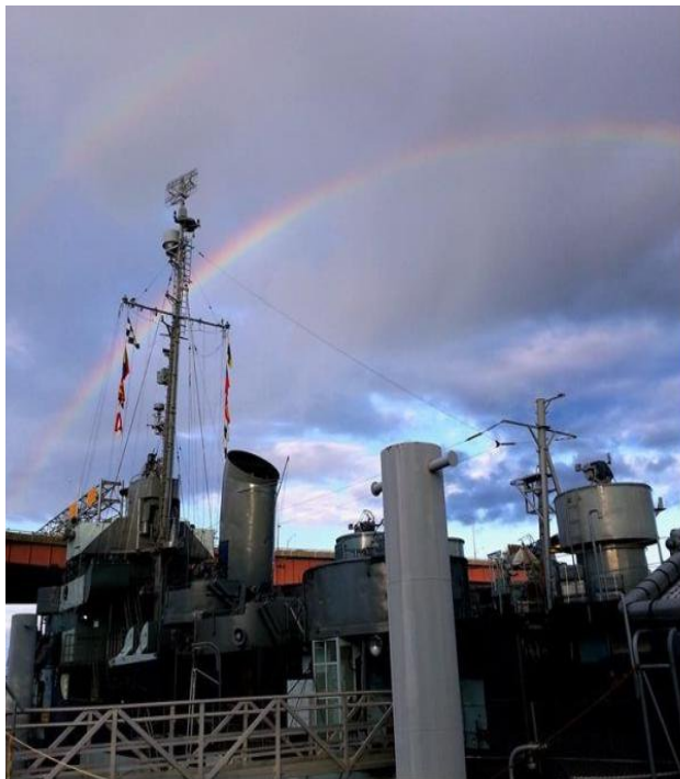
Good fortune smiles on USS SLATER.