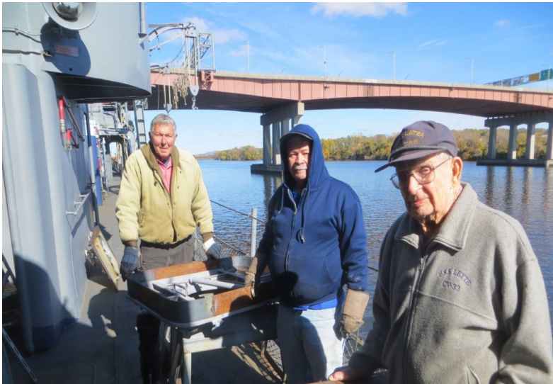
Fitting up a new hatch coaming for the landing force locker.