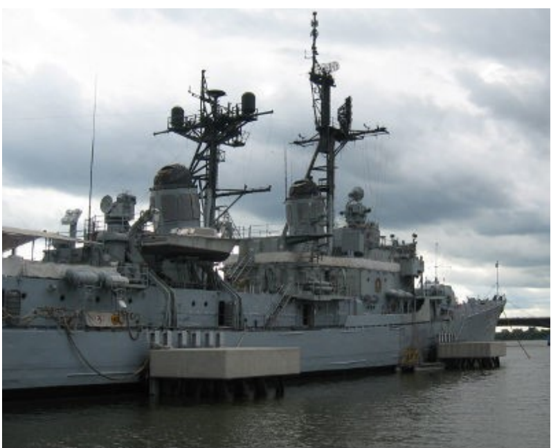
USS EDSON in Bay City. I'm glad I don't have to paint it.

Phone (518) 431-1943, Fax 432-1123 Vol. 16 No. 9, September 2013