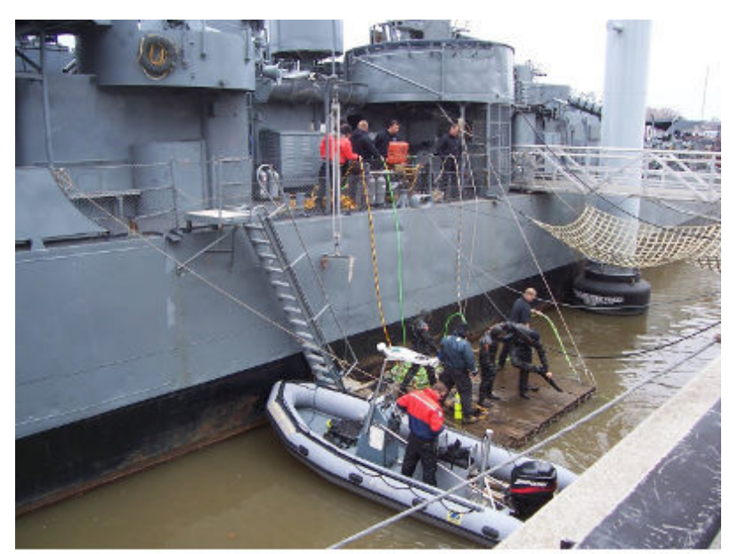
More NYS State Police diver training at USS SLATER.

water alarm he went to the breaker panel, read the tape that said "Septic Pump" and turned on the breaker above it assuming that was the label for the pump. Of course, the pump did not come on with the resulting minor flood.