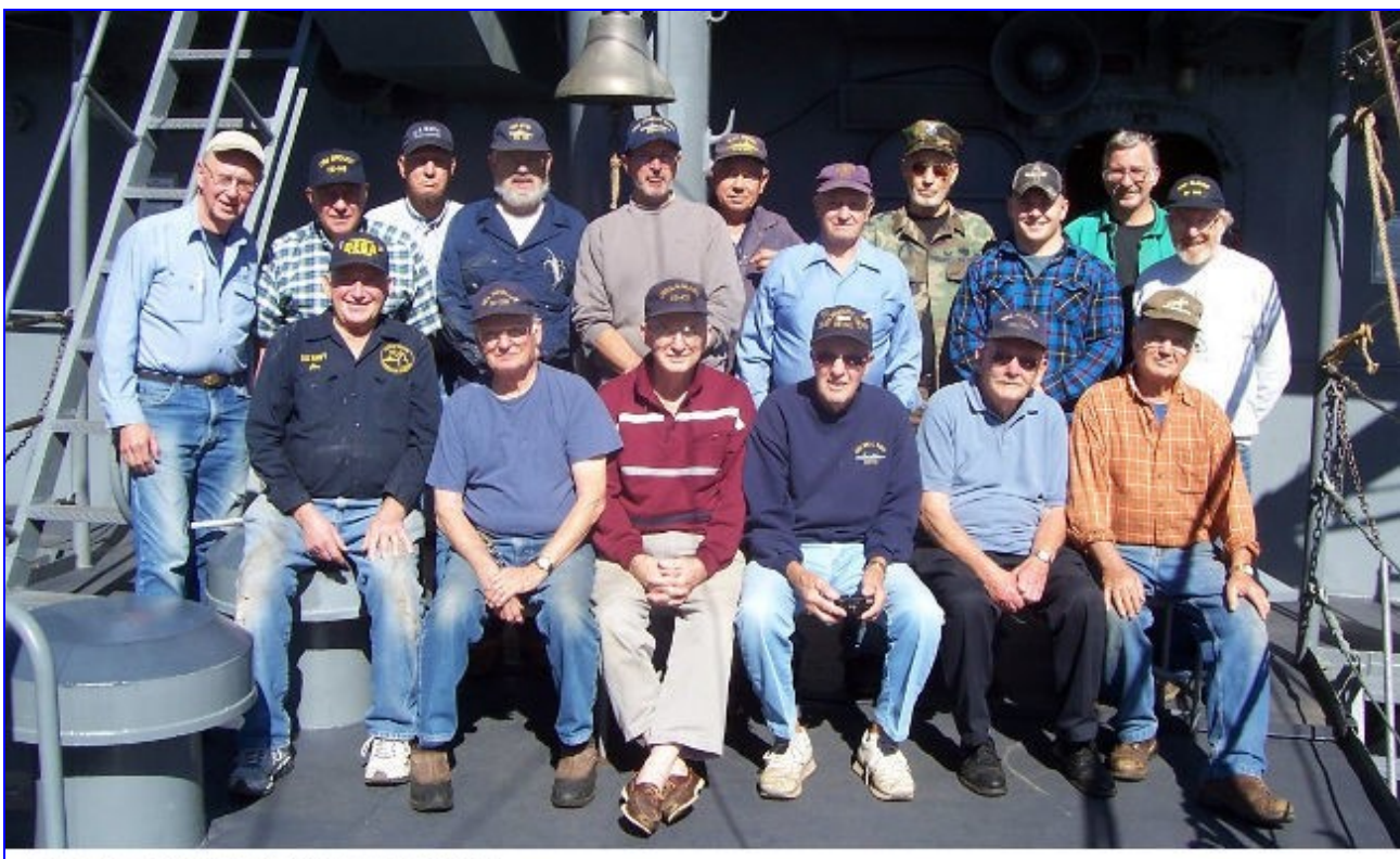
The Fall 2013 work week crew.

Phone (518) 431-1943, Fax 432-1123 Vol. 16 No. 10, October 2013