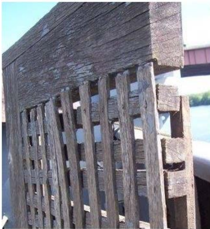
The bridge deck grating before....