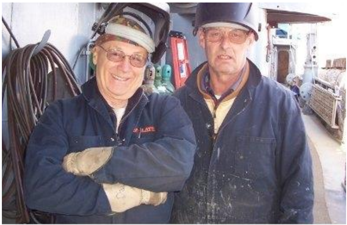
What woman wouldn't want this picture on their night stand?

We can't thank you Winter Fund donors, Hull Fund Donors and Endowment Fund Donors enough. As of March 1, the 2012 Winter Fund Appeal had generated $68,000 in donations, money that is critical to carrying us over into the spring. I'm almost afraid to point this out, but the combined endowment fund and hull fund totals recently put our net worth over the two million dollar mark. It's like the weather we've enjoyed this winter. I don't want to jinx the weather and I don't want to jinx the stock market. Back in 1998 when we didn't know where our next dollar would come from, I never thought I'd see this day. Thank you all for helping to make our progress possible. Next month we should be writing from back on the Albany side.