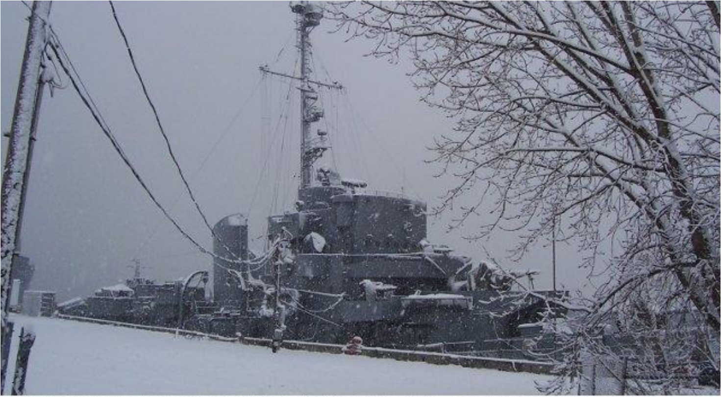
Fortunately we haven't had much of this white stuff, but winter isn't over yet.

Phone (518) 431-1943, Fax 432-1123 Vol. 15 No. 2, February 2012