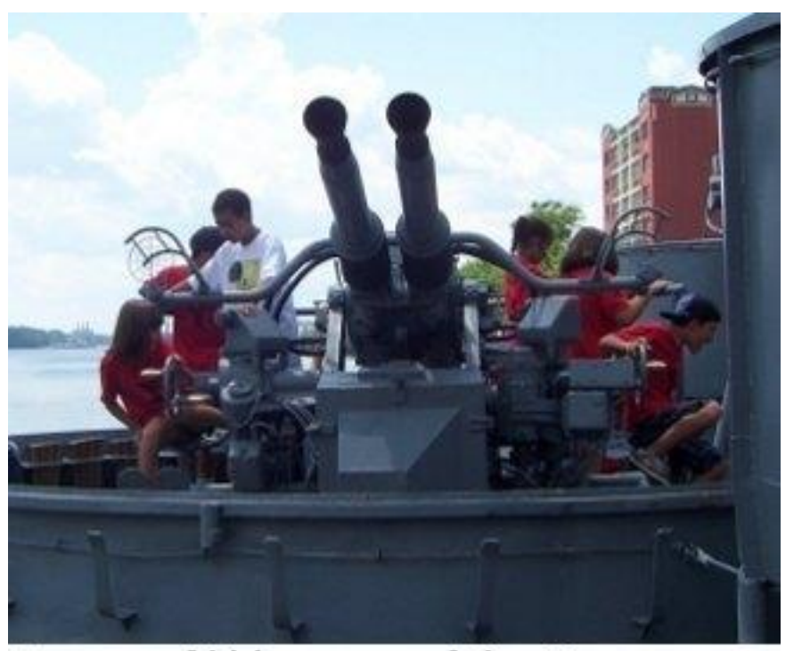
A group of kids on one of the 40mm guns, their favorite stop on the tour.