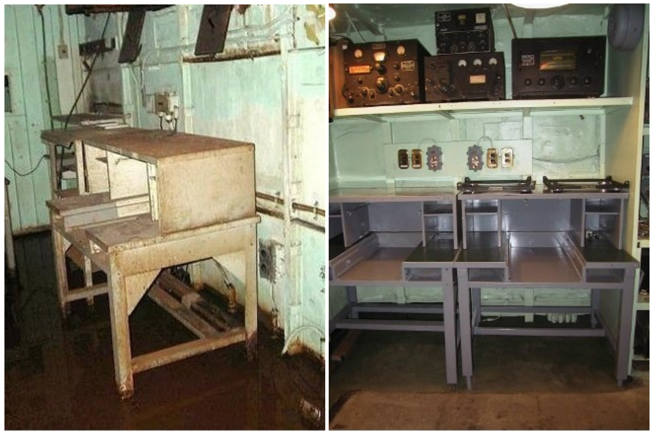
The radio operator's table on the GAGE.