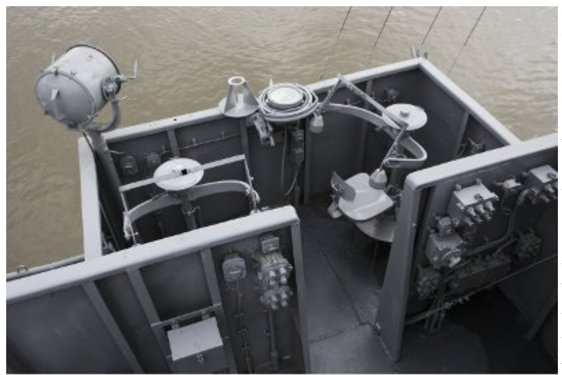
GAGE lookout chairs on SLATER flying bridge.

of pigeon droppings were pressure washed from her decks. I wanted to get up to that stateroom to receive the parts we had staged, but was denied entry until I was trained and fitted with a respirator. I explained that I'd been aboard the ship many times before and had somehow lived through the experience, but that didn't cut it with the yard safety officer. The final straw was when I was told that I'd have to shave the poor excuse for a beard I've worn since 1976. It just wasn't worth going back aboard. I directed one of my clean-shaven compatriots to the stateroom where I had staged our treasure, and there he found a lone sound powered phone box with the Hold for USS KIDD" tag on it, and all the other material had been removed and disposed of. That was 1997, and we did pick up additional 20mm ready service lockers, including several for the Battleship Texas.