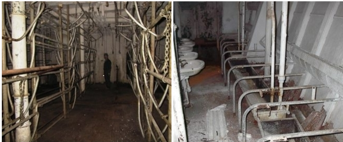
Troop berthing aboard the GAGE.