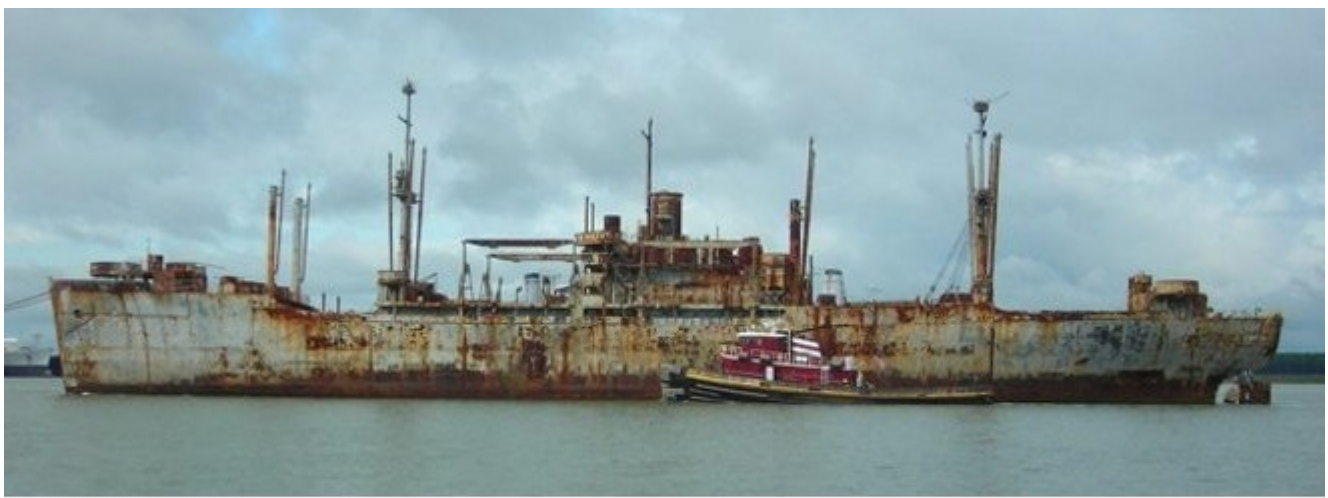
The start of the GAGE's final voyage, July 23rd 2009.

has clung to life, a true ship that would not die. Few ships have given more to the historic fleet than GAGE, and for that she deserves to be remembered. But a proper obituary would take weeks of research and a lot more time than I have. But if I write the story into the gossip sheet called SLATER SIGNALS, no research is necessary, because everyone knows better than to believe what they read here. It's all gossip, hearsay and legend. Parts of the GAGE live on in many vessels in the current historic fleet.