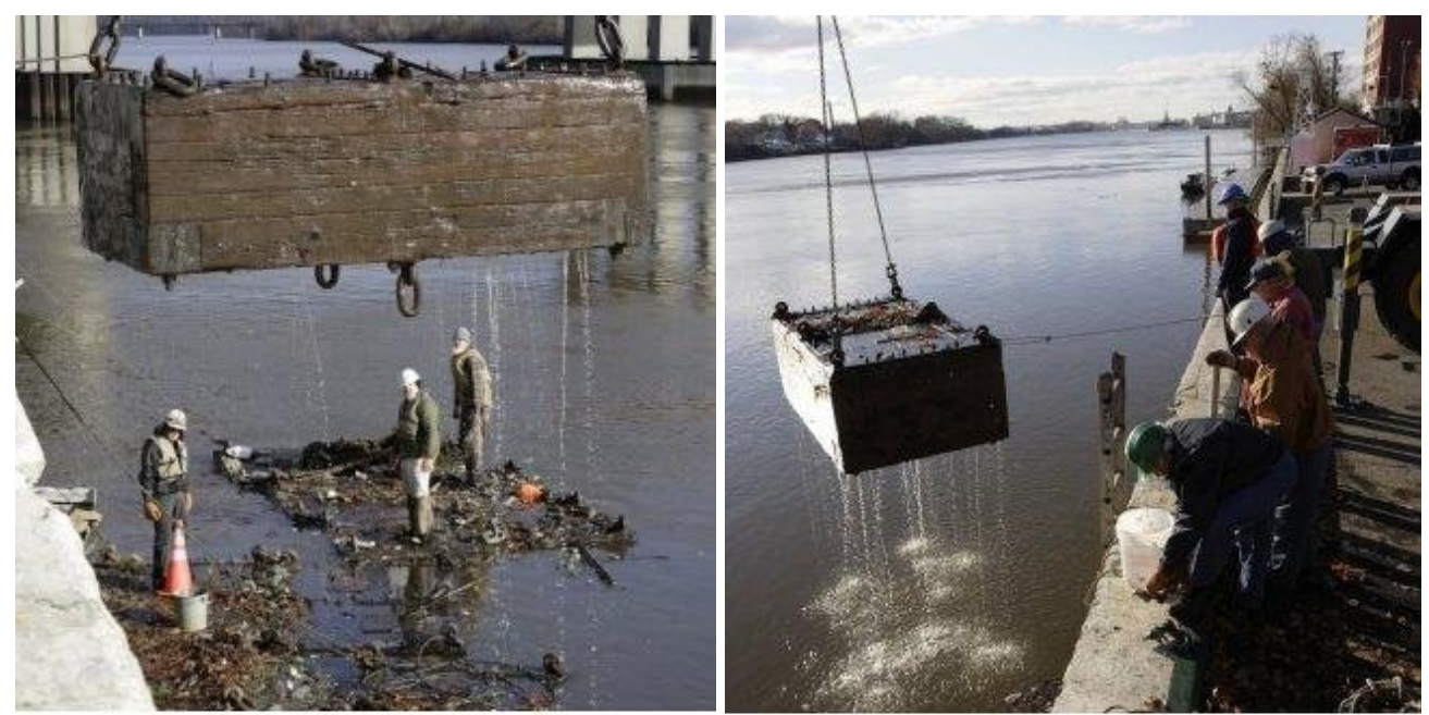
Camels are rigged by the river crew....