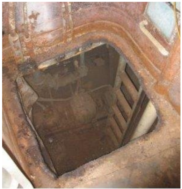
A rusted hatch and deck in the forward passageway will be replaced...