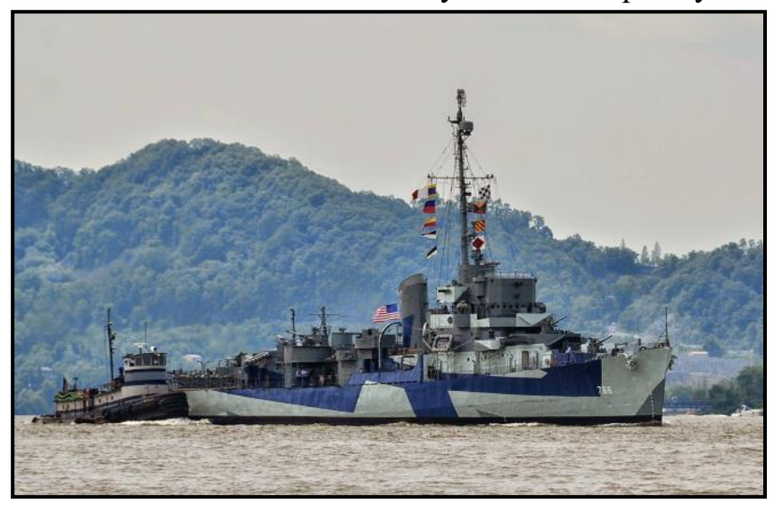
Stay with us, we have had to postpone our shipyard trip. We hope to re-schedule for later in 2020.

And your outpouring of support could not have come at a more critical time. There has never been a time when your donations are more vital to USS SLATER's financial survival than now. Normally, half of our income comes from ticket sales, and half comes from your donations. For the foreseeable future, all our income will be coming from your donations.