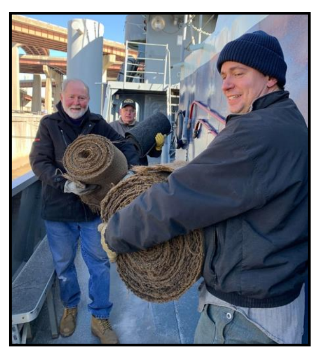
The Deck Crew brought up the coco mats.

We are hoping to go down in June, but right now, all bets are off. In compliance with Governor Cuomo's stay at home order; we have suspended volunteer activity aboard the ship until the order is lifted. The question I asked the crew was, "If you caught coronavirus from someone down on the ship, and got pneumonia and died, would your last thought be, "Why didn't Rizzuto close the ship down?" So, I closed the ship down.