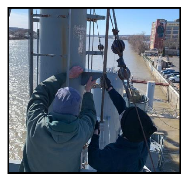
The first pieces of WWII replica gear getting welded onto the mast. These are the brackets that will serve as guides for the bullhorn control rod.