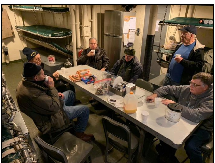
Coffee's hot, heater's on, join us in Chiefs.

We've all got new computers at our workstations, and upgraded all the software. He also moved us to a faster, cheaper server. With newer computers with more memory and faster operating speeds, we're almost in line with current day business practices. Of course, the