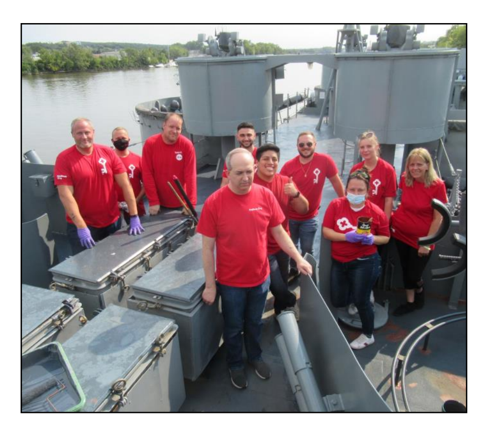
Key Bank employees volunteering aboard!

finished the 01 level forward around gun 32, and is now painting