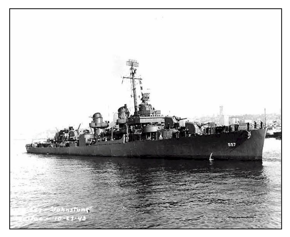
USS JOHNSTON DD-557, October 1943.

Excellence. SLATER was recognized for excellence in preservation of the ship and specifically the restoration of the mast to its historically accurate configuration from 1945. As you all remember this work was completed at drydock in 2020. If you don't remember, take a look at our Drydock Adventures here: https://ussslater.org/drydock. Shanna accepted the award on behalf of SLATER Volunteers and will formally present it to the crew at our fundraising event next month.