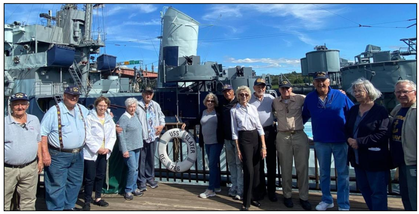
The last reunion of the USS HUSE Association.

reunion aboard USS SLATER this month. The group members have been strong supporters of the project, providing work parties to the ship for over twenty years. Our thanks go to group