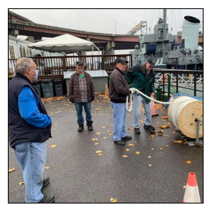
600 feet of line...better get to work.