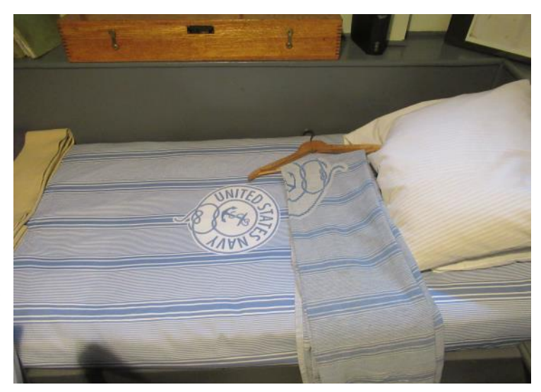
Bedspreads on display in Officer's Country.