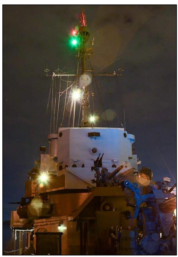
SLATER's fighting lights all lit up!

Prior to the advent of Covid-19, we were working on a project to replicate the old WWII bedspreads. We are now looking to get that project back on track. We are looking for a generous donor to underwrite the cost of reproducing the old Navy officer's style bedspreads. These will be on display in the Captain's cabin and throughout officer's country. We are planning to purchase 20 replicas, as our original WWII bedspreads are showing wear, after 20 years aboard. The estimated cost will be $4,000. If this strikes you as a worthwhile project, please get in touch with us.