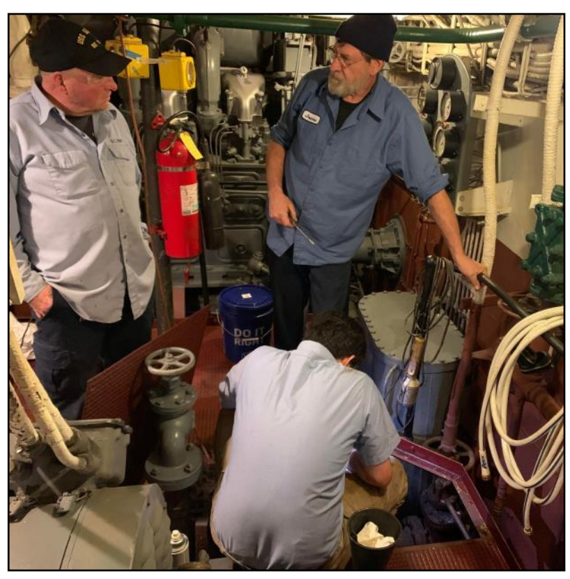
The engineers have winterized the diesels. With your support they will be working on bilge preservation throughout the winter.

Thanks to our Save America's Treasures Grant, we did vital restoration work in the muffler room and on the first and second decks forward. And thanks to our Tin Can Sailors Grant, we were able to repaint all the areas that we restored, including the CPO Mess, forward berthing, officer's country, and the wardroom.