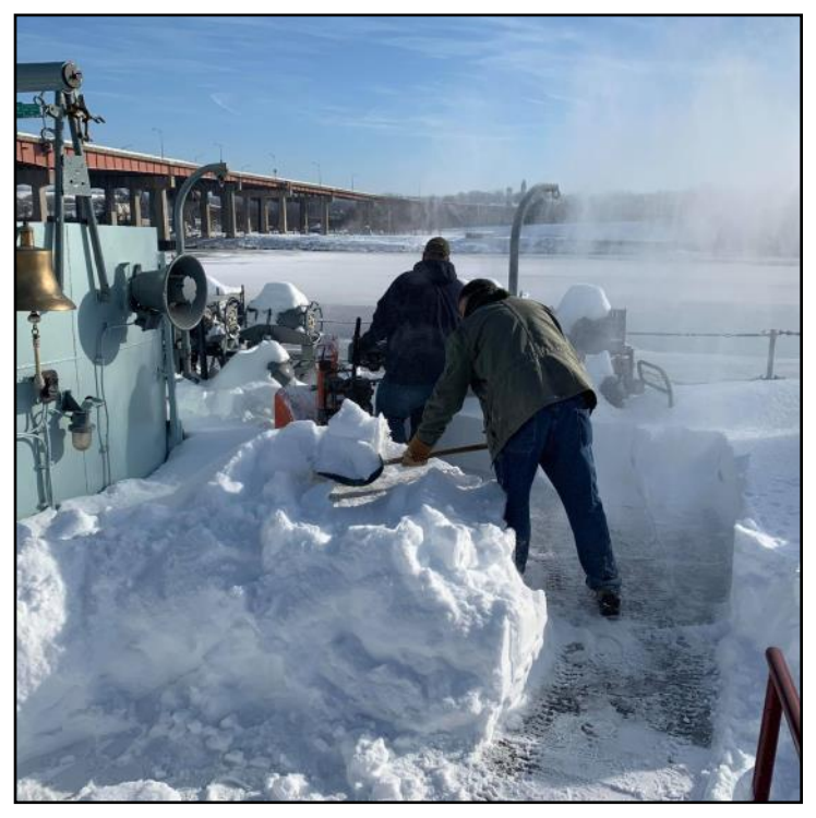
The time is coming when we'll have to dig our way to the work bench.

November. You long-time USS SLATER supporters know what that means. As I watch the tour season wind down and look ahead to another long Albany winter, I ask myself how we are going to get through another winter without draining our cash reserves. We have three big expenses pending. First is the installation of our modular visitor center that we hope to have in place for the start of next season. Next, we are embarking on a program of fuel tank preservation, with the initial funding provided by our Tin Can Sailors Grant. And third, it's not too early to be looking toward our next dry docking in 2030, and making sure that we have funds available for that journey.