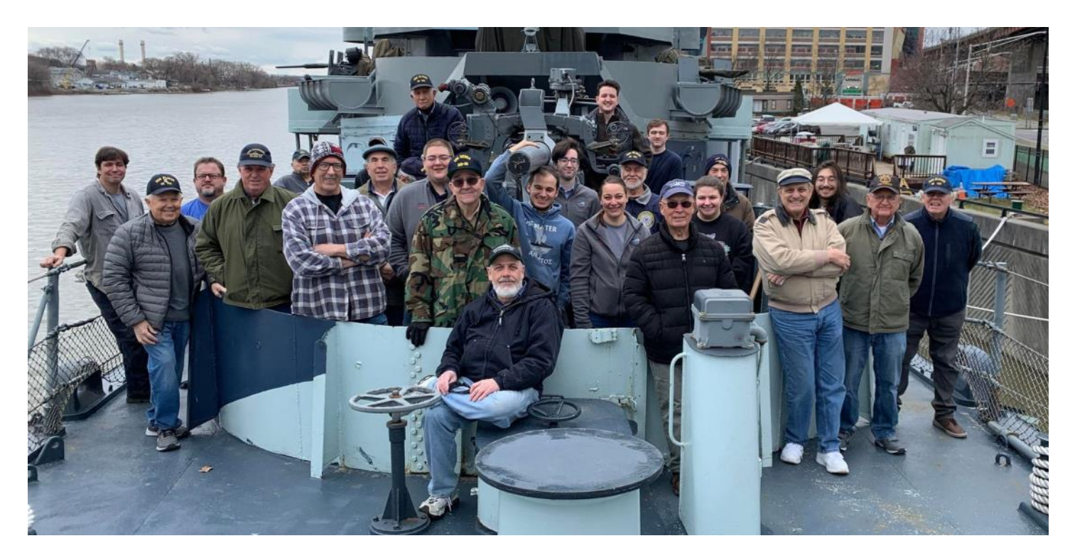
Our brilliant tour guides were back in force! They are ready for next week and kicking off our 25th season in Albany!