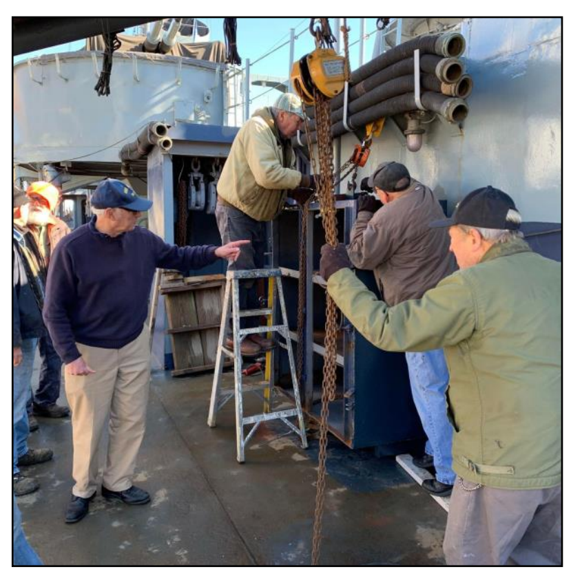
Let's get this locker back in place. All hands on deck!

feat, because these weigh about sixty pounds each.