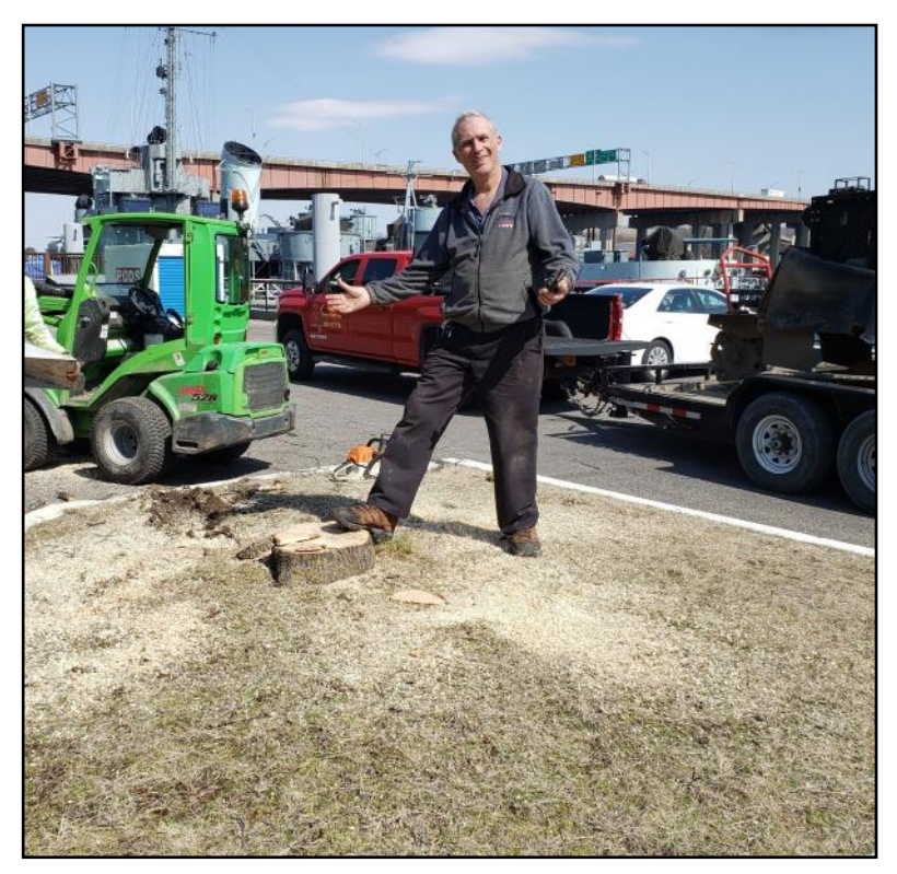
I spent 25 years trying to protect that tree, but in the end, Gary won.

Part of the preparation also included removal of two trees that were very near and dear to my heart. One, in the parking lot, will give us at least five more parking spaces. The beautiful tree next to the handicapped ramp had to go to make way for the new aluminum handicapped access ramp. At least I got some firewood out of the deal. Shanna and Gary met with our contractor to go over the logistics of removing the trailer and installing the two sections of the new building. The plan is set and we're ready to get the show on the road! Now we wait for the building to finish being built.