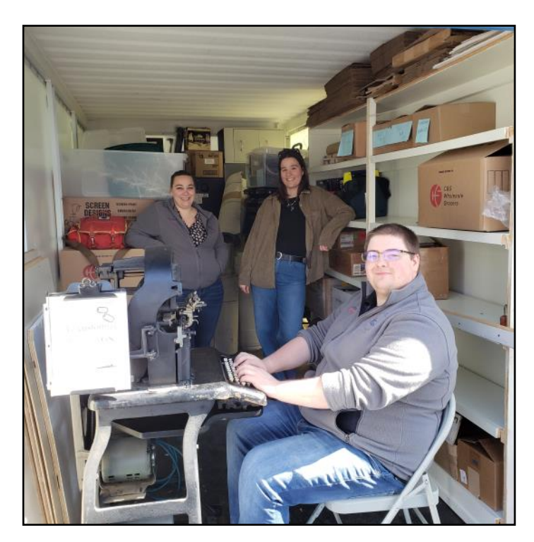
Life in the POD. The is the way its going to be for the next couple of months.

of Albany, and Berkshire Bank. However, we find ourselves about $50,000 short of the total cost needed to move them out of the wardroom. Be on the lookout for our spring solicitation