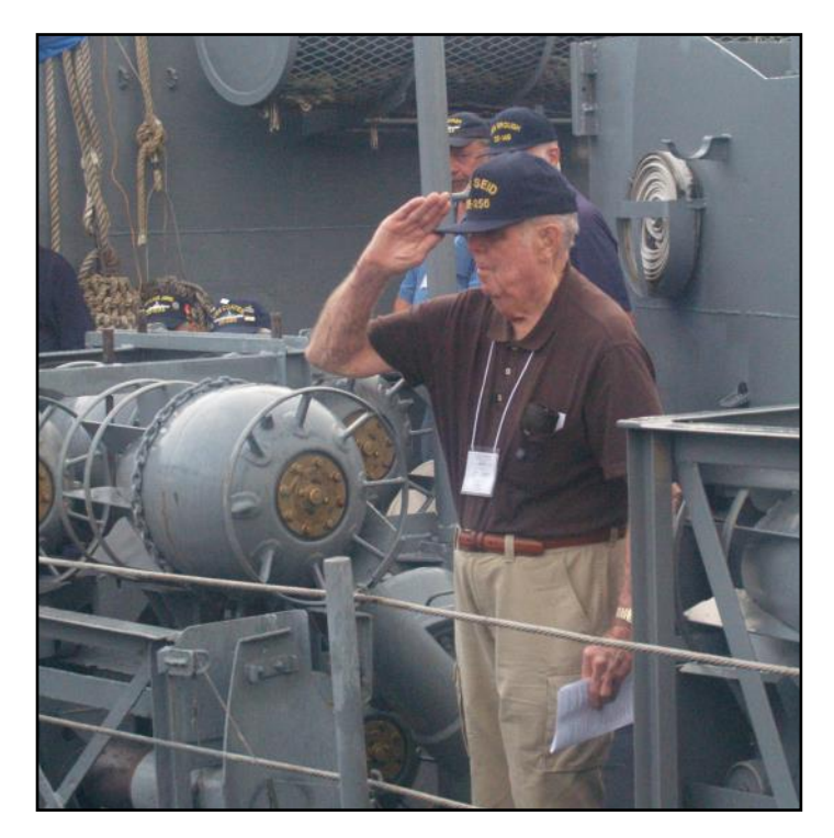
be drinking the bottle. The bottle will reside aboard USS SLATER, as the ship will be the "Last Man," the legacy of the Destroyer Escort Sailors Association.

Administrator for so many years, reminded me that she has possession of the "Last Man Bottle" and will be bringing it to the final DESA Reunion. However, the "Last Man" will not