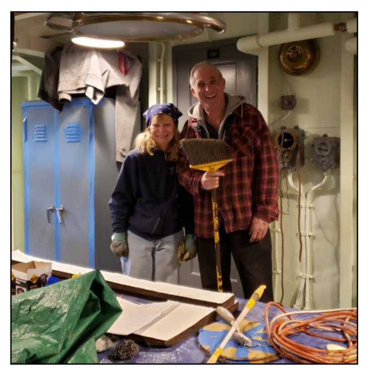
Sure, we can have this cleaned up for opening day.