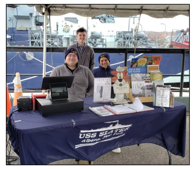
The tour guides operated from under a tent for the whole month of April.

When we officially heard that we had been awarded $500,000 from the ARPA Grant, to be split with Dutch Apple, we were ecstatic and ready to move forward with the plans we had been discussing. This grant money would allow us to tear down the existing outdated buildings, construct two new buildings, upgrade our internet service, install security lighting in our parking lot, and repave the parking lot.