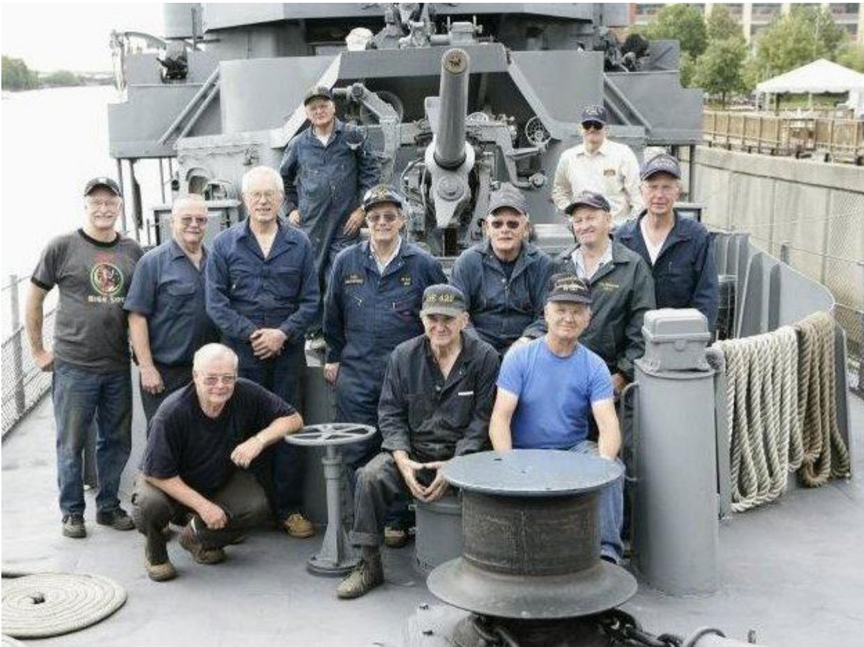
The Michigan Fall Crew pose with the SLATER Tuesday regular volunteers.

Phone (518) 431-1943, Fax 432-1123 Vol. 8 no. 10 October 2005