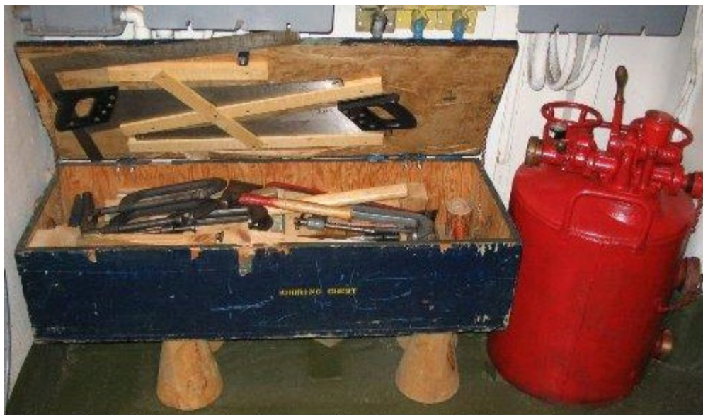
The restocked Shoring Chest sits next to the repainted Foam Generator.