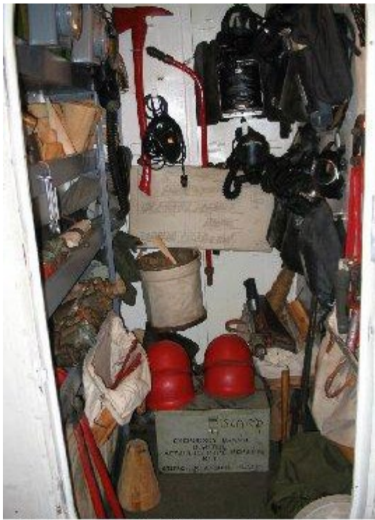
DC Equipment in Aft Repair 3 cleaned, restored and (we hope not) ready for use.

various storerooms. Most of the equipment had to be reconditioned and restored to its original condition as much as possible. For the next three days they hauled equipment, scraped, wire-brushed, ground, chipped, sandblasted, painted, oil-coated, lubricated, cleaned tools, gas mask, breathing apparatus and the spaces. They then assembled as close as possible the complete WWII DC Equipment Inventory of Aft Repair 3. To restore the locker, everything was removed, the space cleaned, and then they had to arrange and remount all the restored equipment in an organized layout. This included installing new brackets, hangers and hooks. They organized the equipment for each function and provided a toolbox or bag for most of the items. Some equipment was placed on shelves. The Shoring Chest, Duplex Foam Proportioner, Mechanical Foam Nozzle, one All Purpose Nozzle, Spanner Wrenches, Telephone Head Sets, red devil blowers, P-250 pumps and eductors equipment were arranged in the passageways near Repair 3.