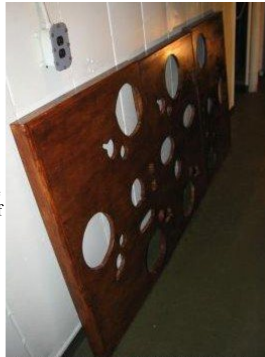
The Fiddle Board stored in the forward passageway.