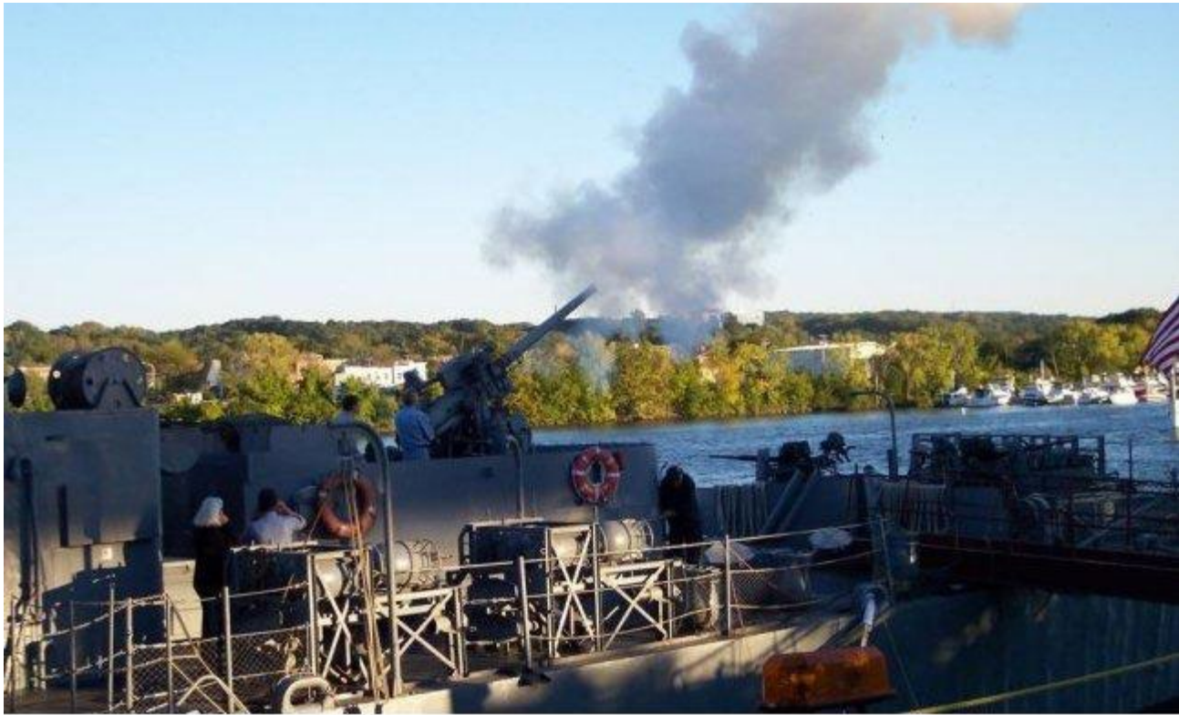
In memory of all our departed shipmates.