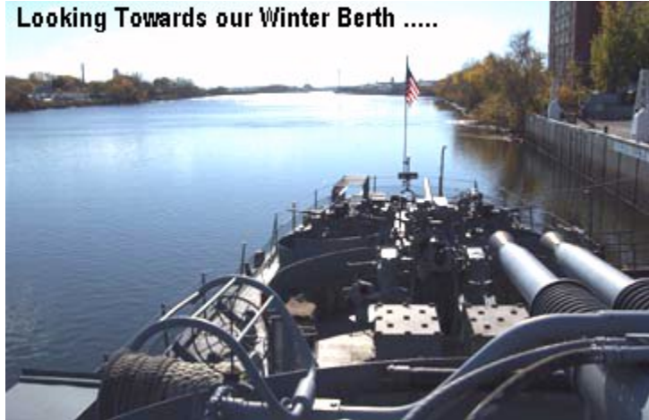
Looking Towards our Winter Berth .....