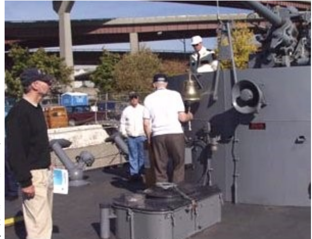
Final Tour Days

In an effort to capture every last dollar out of a tourist season that ended a month ago, we stay open, on the full summer schedule, right through Thanksgiving weekend. Most days, it's too cold to operate from under the tent, so we have to pull back operations to the eight-foot by ten-foot ticket shack, where the guides and cashier huddle around the little fifteen-watt space heater. Obviously, during the fifteen years the Ship's Sup spent in Louisiana the heat must have gone to his brain, and he doesn't know this isn't Louisiana. In Louisiana, November is a beautiful month. Thanksgiving weekend can be one of the busiest weekends of the year for museums. So what's the problem? The problem is this is upstate New York, and not Baton Rouge. This is the onset of winter, besides hunting season! So what if some days we only make fifteen dollars. Doesn't our mission statement say that we are to restore and maintain the USS SLATER for public display?