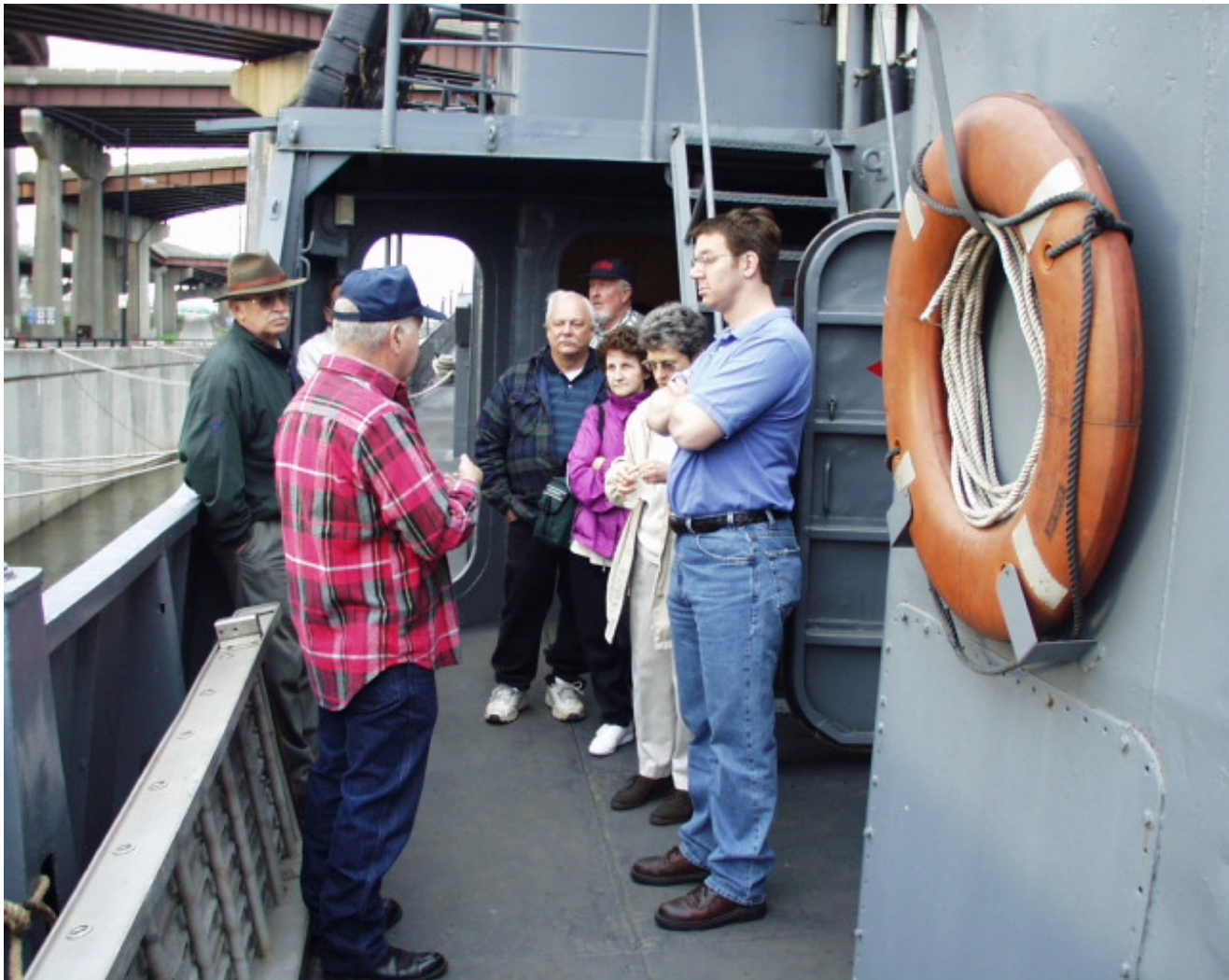
Tours continue through November.