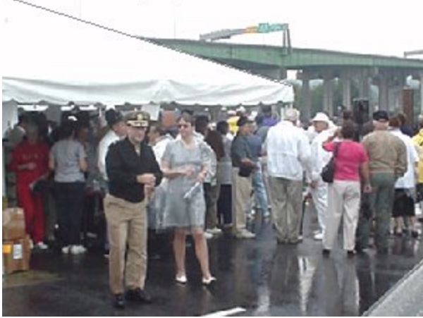
A fine rainy day

The only thing we couldn't control was the weather. As the big day approached we gradually watched the long range forecast, which called for great weather while it was long range; gradually deteriorated until it called for a ninety percent chance of rain by the time it became the short range forecast. The skies looked ominous as the twelfth dawned, but the rain held off.