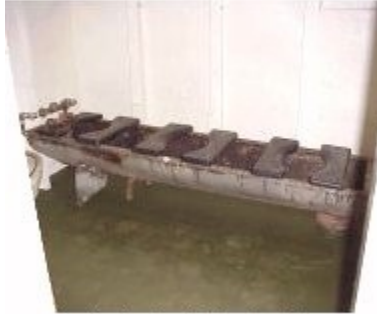
Most stories told about here.