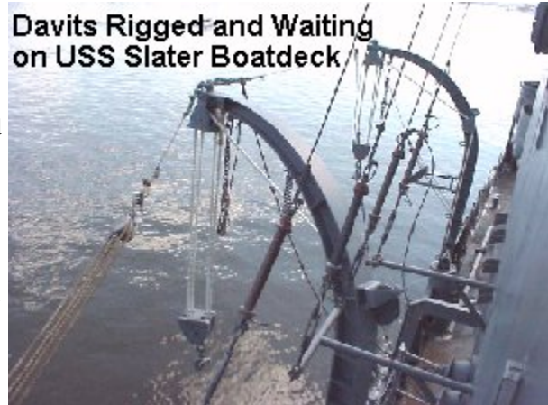
Davits Rigged and Waiting on USS Slater Boatdeck