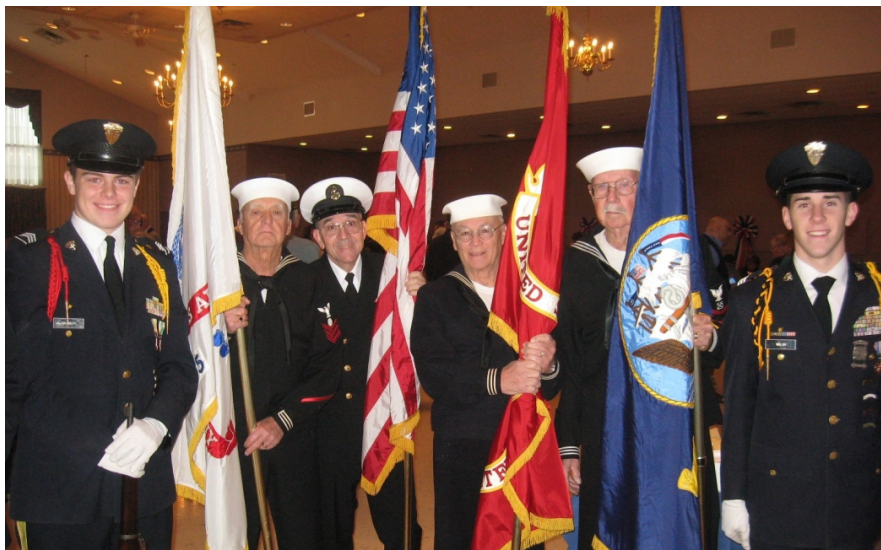
The SLATER Color Guard on Pearl Harbor Day.