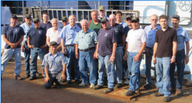
The riding crew that brought USS SLATER home.

touching up the camouflage, and Thomas completed restoration of the aft head porthole.