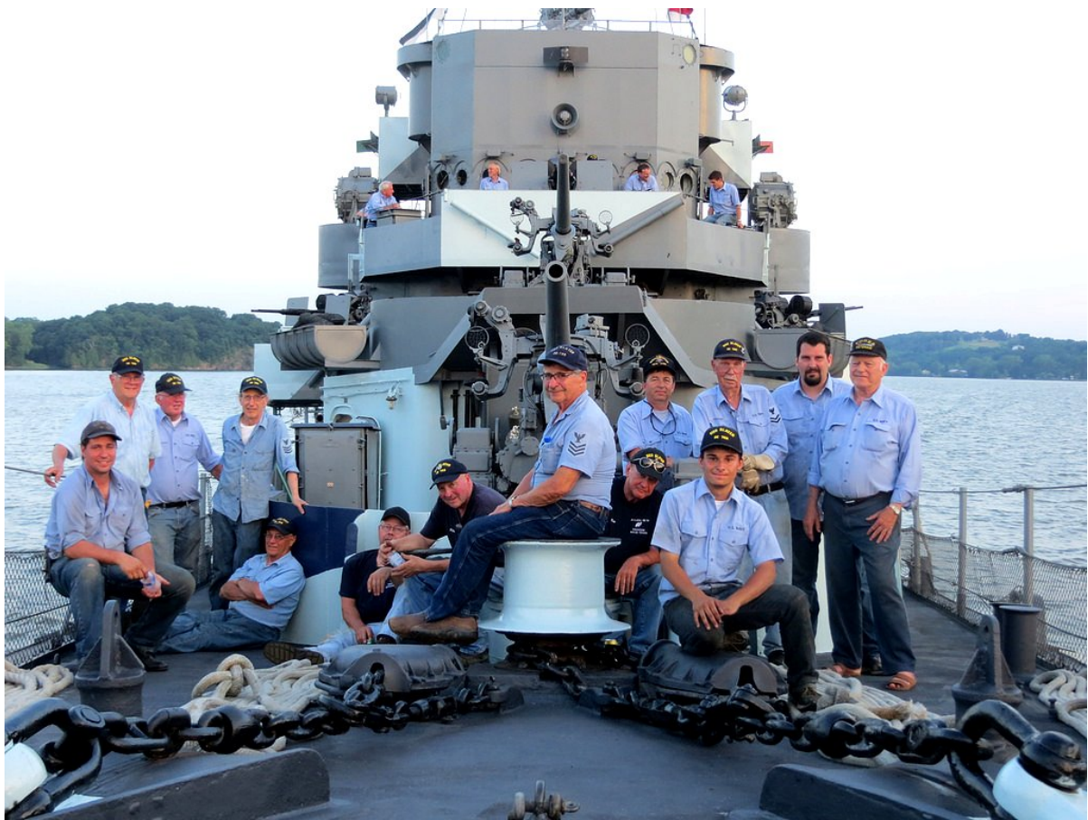
The homeward riding crew.