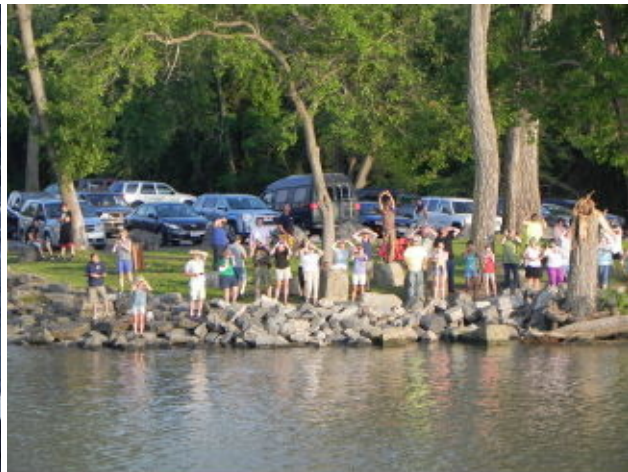
Crowds gather ashore to watch our passing.