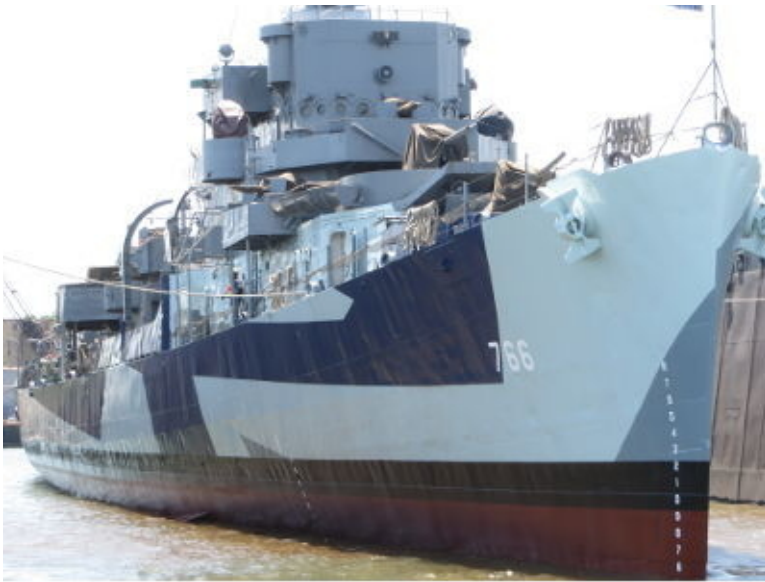
The dock slowly sinking on launch day.

locker. Boats got the absentee pennant flying and made breakfast and lunch. Down below the yard crew got the entire boot top roughed on and started the cutting in on the bottom edge on port side. They got up to the start of the port roll chock with the cutting in. We gave them bottles of water as Brandon and Joe brought more food including five 32-pack cases of water. They came back Sunday to finish the rest of the cutting in on the bottom side of the boot top.