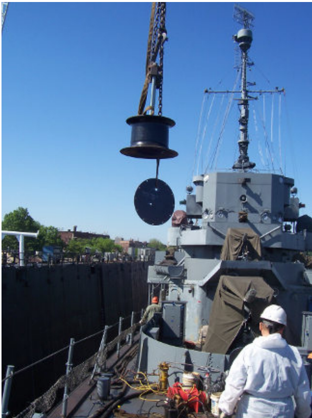
Harry Rodriguez lifts SLATER's capstan off for blasting.

cleaning out the drydock and working on the rudders. Union Maintenance blasted and primed all the new weld work on the doublers and they painted out the chain locker and primed ballast water tank C-10W. The yard also removed the capstan for blasting and painting. The volunteers worked on using Epoxy on the snaking tie down bar to keep rainwater from streaking the hull, as a stopgap, until permanent repairs can be made. That week it rained all Thursday morning so the yard worked under the hull out of the rain bolting on the magnesium anodes and they painted out the white in the depth charge magazine. The volunteers cleaned in compartment C-201L, and then trashed the place as we worked to fix a split drain line we discovered. That same afternoon the volunteers raised both anchors and chain with our windlass.