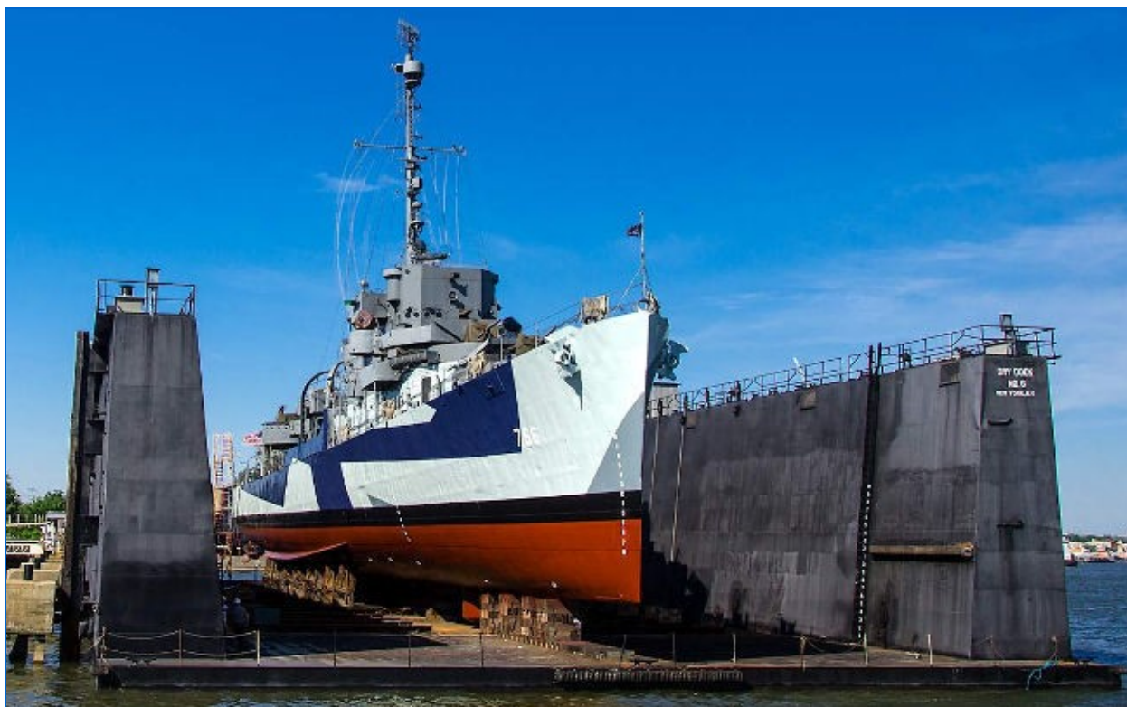
USS SLATER in Drydock Number 6 ready for launch.

Collectively, we did it! Since 2010 we raised $1.3 million, laid out a work plan, got USS SLATER towed to the shipyard, blasted and painted the hull, surveyed her, reinforced the waterline and several other suspect areas, did about 500 other odd jobs around the ship, painted her up in camouflage and brought her back looking unique and better than ever.