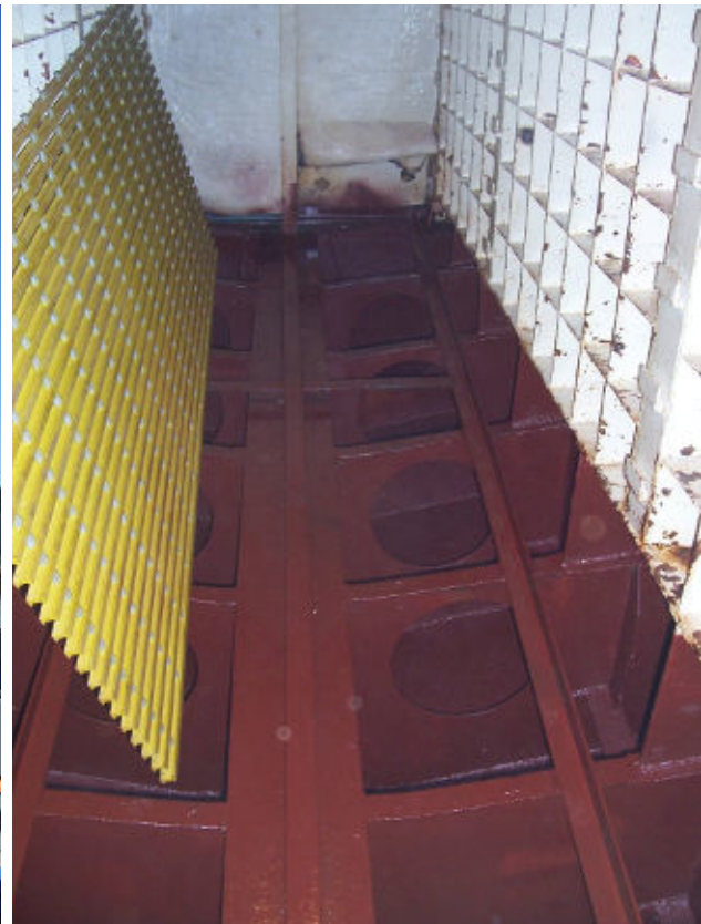
The depth charge magazine bilge after scaling and painting.