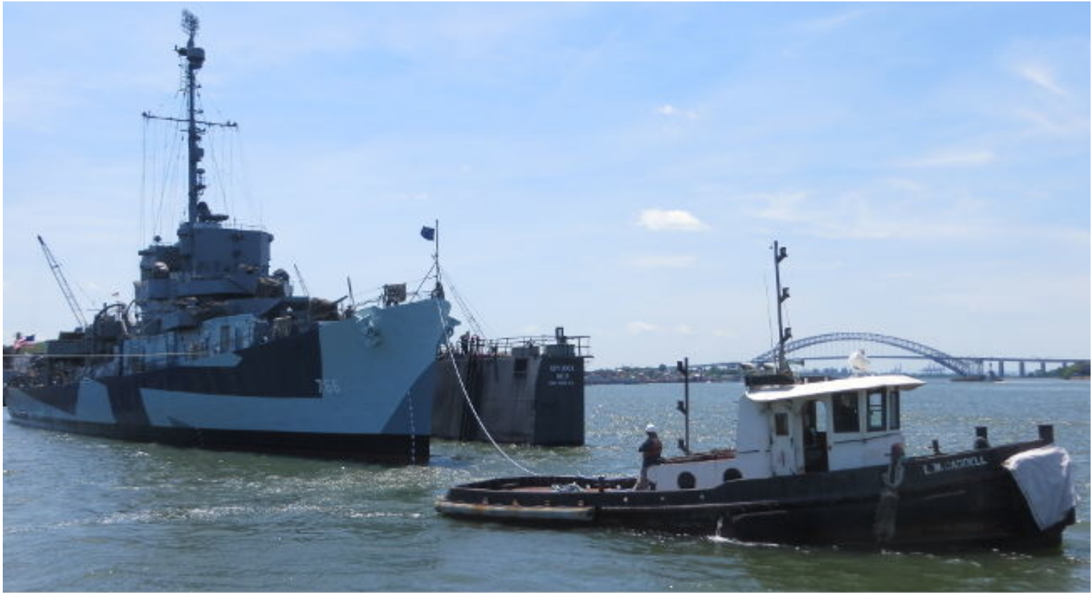
Afloat again, USS SLATER leaves the drydock.

On Wednesday June 18 th , around noon the yard flooded the drydock and we were floated out. We made a last check of all the tanks, bilges and voids as she floated off, but no problems were found. After 11 weeks we were starting to feel like we had grown roots to the drydock. The Caddell yard tug and two assist tugs provided by Henry towing moved us west one slip to floating pier “B” where we moored portside to. It didn’t take the yard long to get us our electrical and water back. With 90% humidity and 60% chance of rain in the morning, it was a less than perfect day for painting but Bill Wetterau, Ron Prest, Gary Dieckman, Thomas Scian and John Burroughs continued cutting in the superstructure camouflage under overhangs. By that Friday the volunteers had finished camouflage on the main deck house and moved up to the 01 Level. That Saturday Barry Witte brought aboard volunteers ENS William Gregory, Steve Bologna-Jill, Jesse Futia and George Gollas. Working with the week 11 crew, they provided the youth and muscle to finish the superstructure painting. We used a modified 32/3d pattern, leaving some areas haze gray that were just painted last year including the stack and pilothouse exterior.