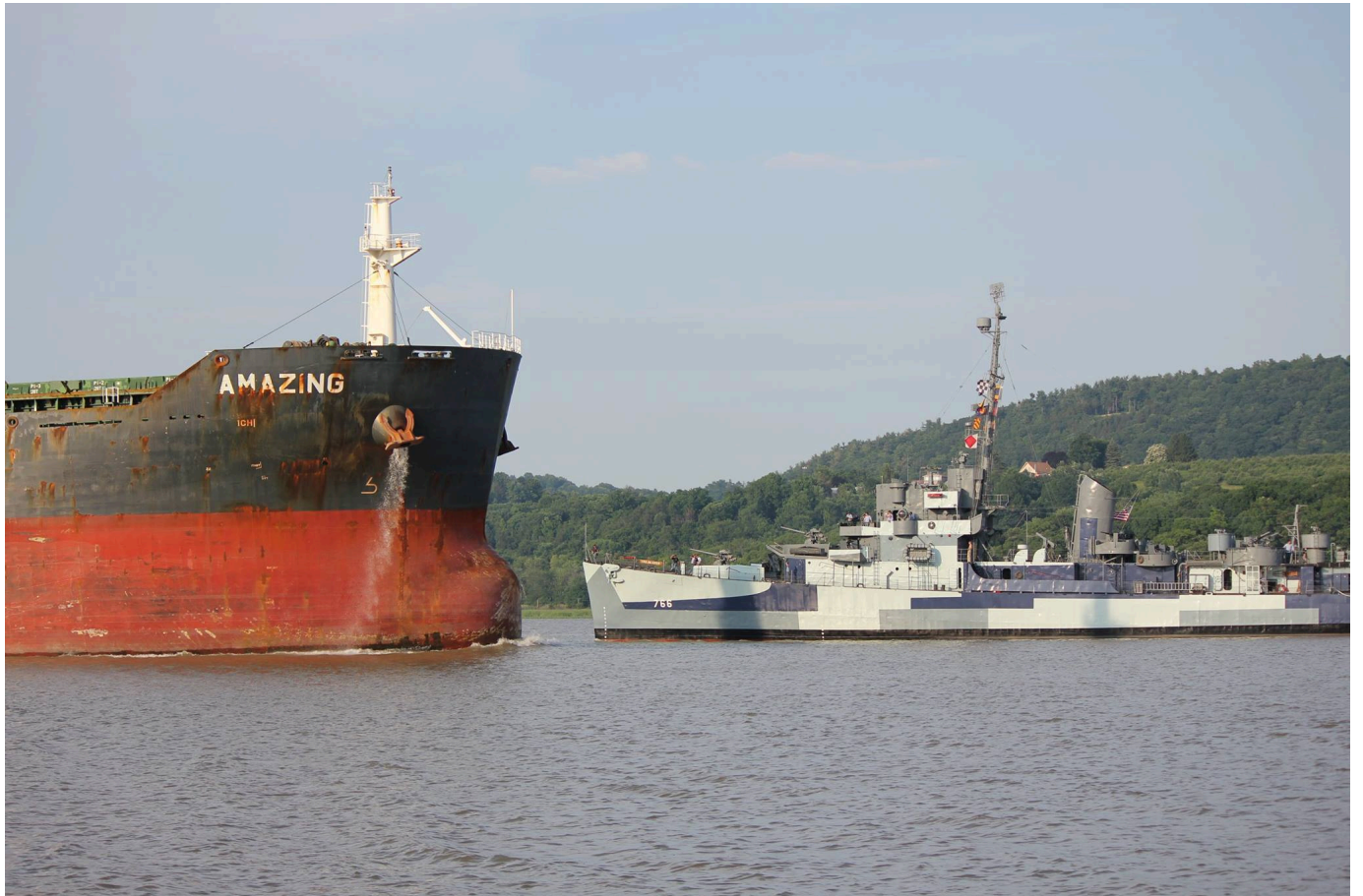
This picture says it all. It was amazing.