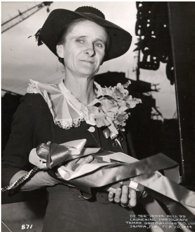
On February 13th we celebrated the 70th anniversary of USS SLATER's launching.