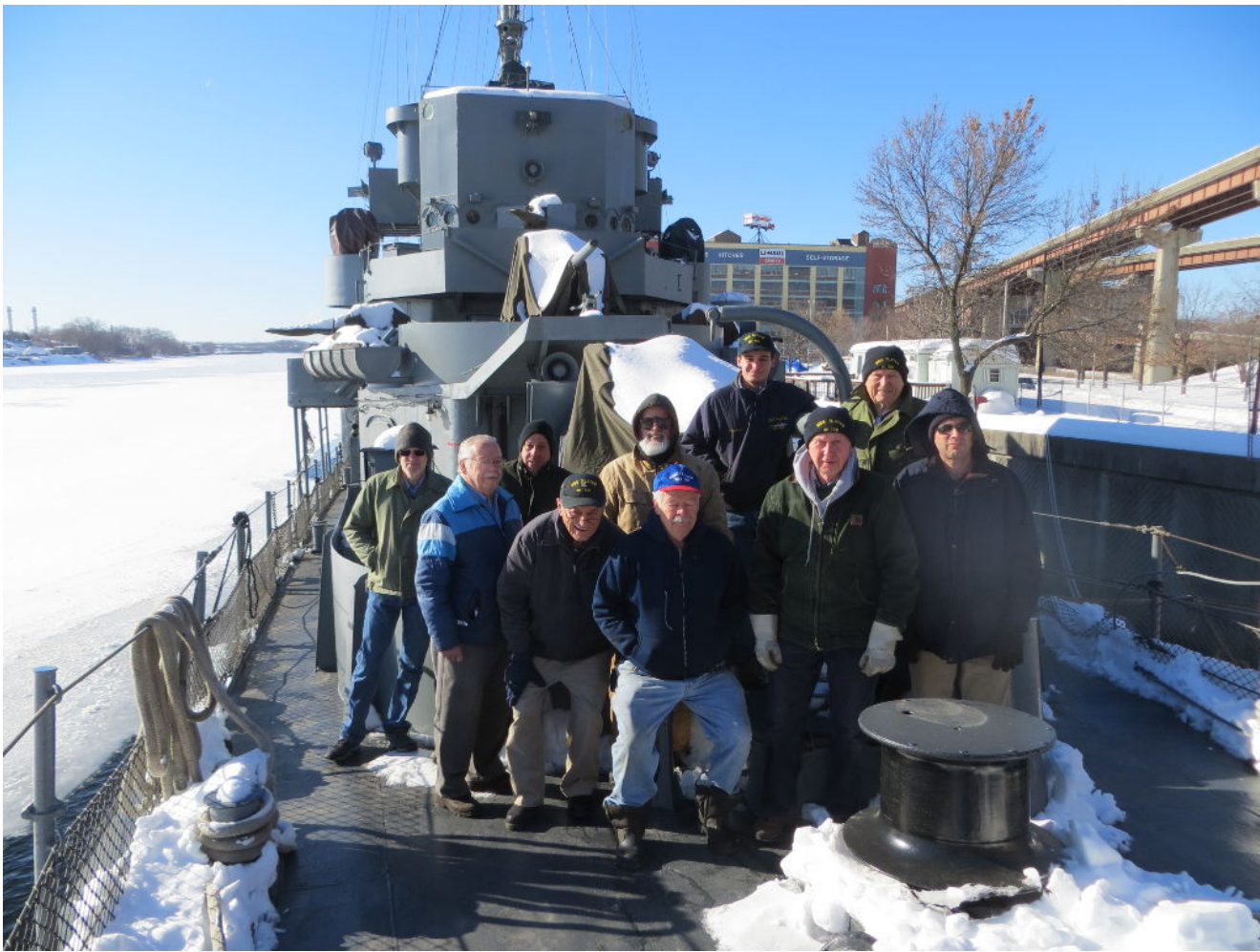
This photo of the Monday crew made us a finalist in the Capital Region Gives contest.

This month the Times Union newspaper ran the second round Capital Region Gives Contest. After readers have cast their votes, six finalists will move on to a final vote beginning March 20. We will send the link out to everyone on the SLATER SIGNALS list and post it on Facebook, but the important thing is that all of you need to be looking for the link to vote and then share it with all your friends. At stake is a $5,000 cash prize and $5,000 in free advertising. The second place finisher receives $5,000 worth of free advertising. The winners will be announced April 10 in a Capital Region Gives special section, a comprehensive Times Union project to help the community connect with local nonprofits. Readers can cast one vote per computer.