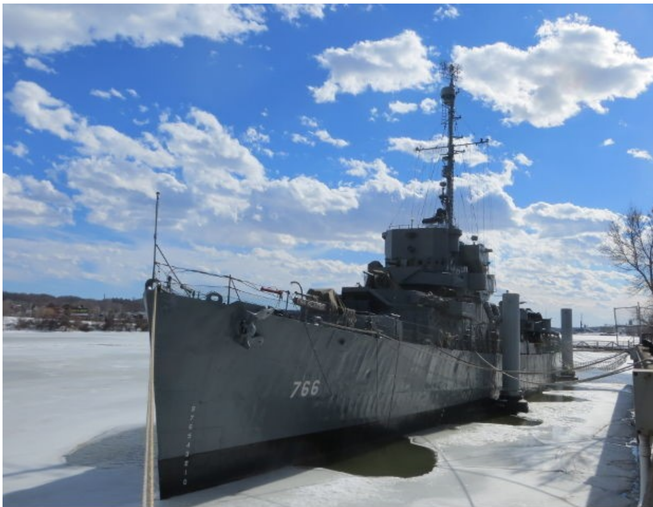
Still waiting for a thaw.

Phone (518) 431-1943, Fax 432-1123 Vol. 17 No. 2, February 2014