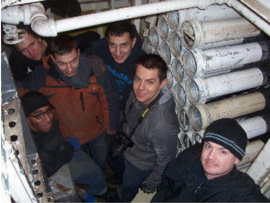
The Sailors from NSA Saratoga Springs cleaned out the forward magazine.

Suffice to say, they ship has been riding beautifully here at the Snow Dock, with no undue strain at all on the wall. And despite the fact we haven't had any running water for a month, Smitty continues to keep the crew well fed on Saturdays and Mondays. We've continued to have the support of the Sailors from Naval Support Activity Saratoga Springs. They have completed offloading all the material that is going to go ashore, cleaned out magazines, restowed all our inert ammunition, and have done a lot of general cleanup so we'll look respectable when we hit the shipyard. They have also been sorting tubes and when we needed shock mounts for the radio gear, they knew just where to look.