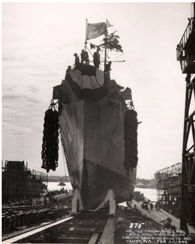
Sliding down the ways at Tampa Shipbuilding.