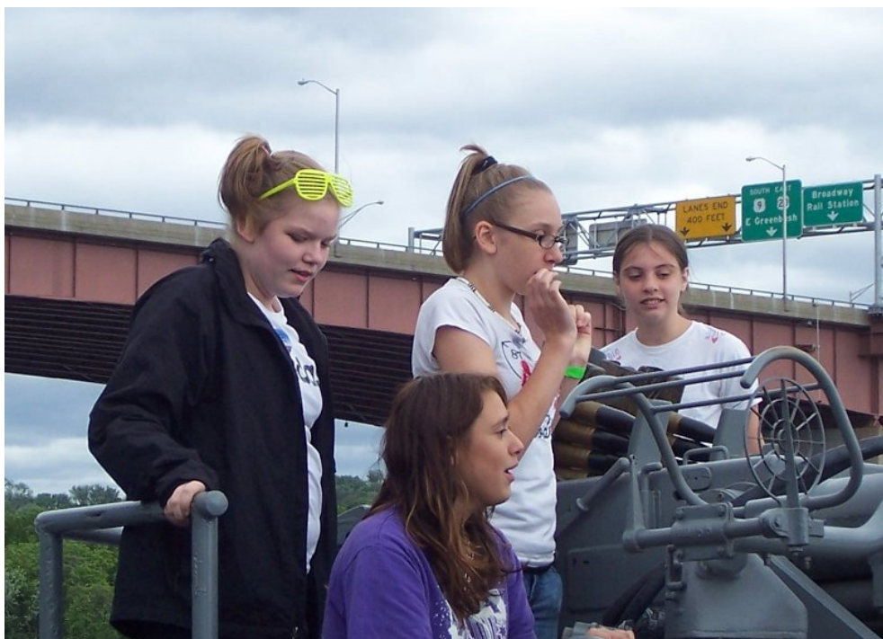
No computer simulation here. This is real history.

We've put the finishing touches on number six roller loader for the depth charge projector. And three new displays have been installed. On the Observation Deck we have a series of signs that show what the ship looked like when she came over from Greece. In the classroom, Frank McClatchie created a wonderful exhibit on the successes of high frequency radio direction finding against the U-boats during the Battle of the Atlantic. And down in B-3 the engineers have created an exhibit that compares a lawnmower piston to a car piston to one of SLATER's pistons so visitors can compare the relative sizes. We're once again indebted to Herb Dahlhaus who managed to come up with the 268A piston and rod.