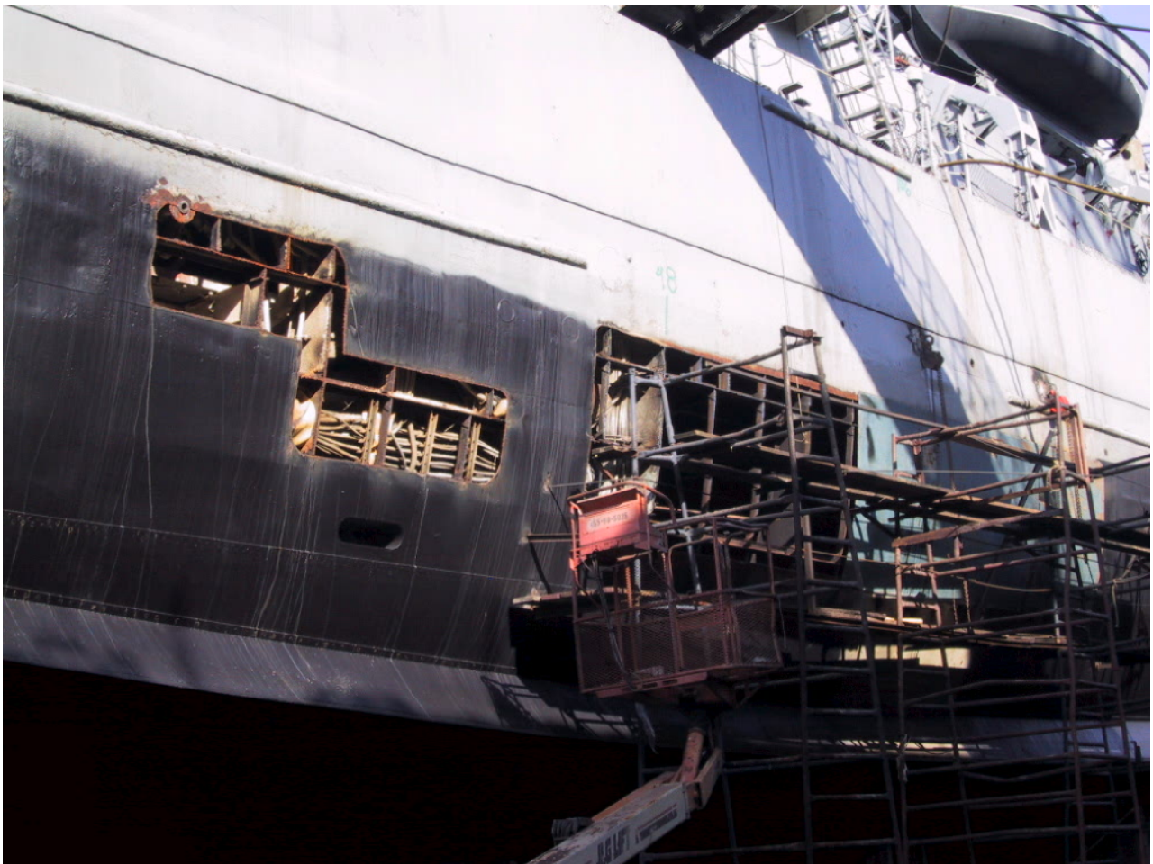
This photo off USS EDSON shows the type of repair we hope to do on SLATER.