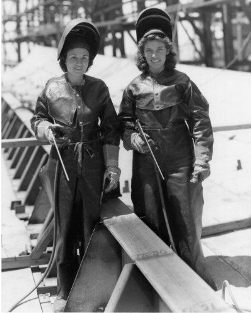
Our poster girls for the Hull Fund Drive.