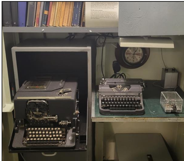
The acquisition of our Electronic Cypher machine was one of the great improvements of 2023.

Conference, built our new Visitors Center, and had a banner year for our education, collections, and maintenance crews. If you're following us on Facebook and reading SIGNALS each month, you know what a great year we've had; the ship has never looked better. With the exception of our two trips to the shipyard, 2023 has been our most productive year since USS SLATER arrived in Albany. When you count the accomplishments this past year, it is almost staggering.