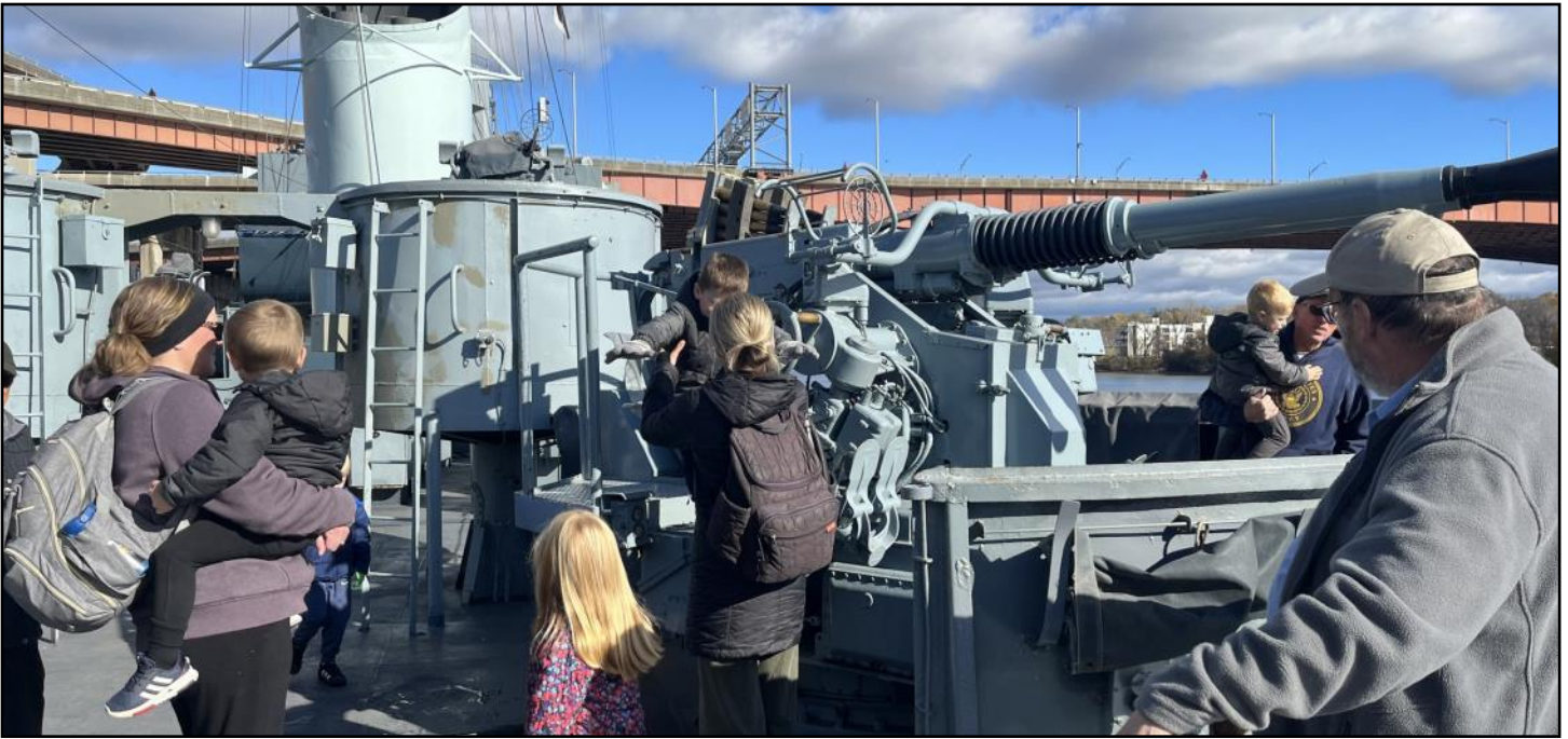
It was a great year for tours.