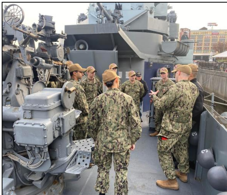
RPI Midshipmen getting a lesson in naval history.

The biggest news in our Collections department this month was the renewal of one of our most important loans, the Electronic Cypher Machine (ECM). In the Fall of 2022, a visitor on tour learned we did not have an ECM on display, though we have the safe for it 15 years. He made some calls and the National Cryptologic Museum reached out, and offered to loan us a unit! We agreed to a one-year loan period, and last winter the Coding Room was fitted out with the ECM safe, some manuals, and the ECM.