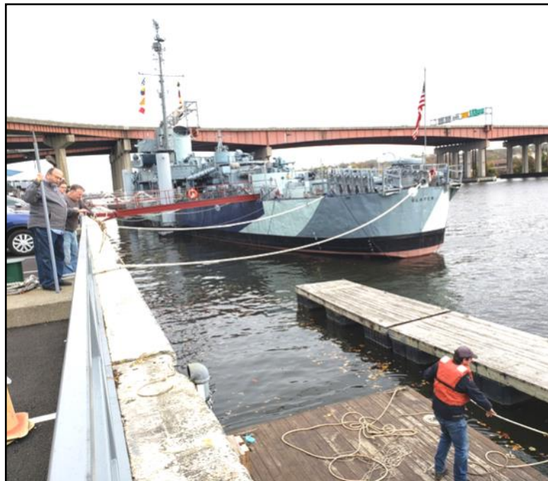
Another annual event is moving the work float to the Dutch Apple dock, so it can be hoisted ashore for the winter.

scaling, trying to punch holes in the deck. This was done so Doug and the shipfitters can finally locate all the holes and get all the leaks welded up once and for all. As part of the process, they removed temporary covers on the base of the Main Battery (MK-52) Gun Director. These temporary covers have been in place since before the ship came to Albany, and removing them revealed a rat's nest of corrosion and wasted stuffing tubes under the gun director. Accessing the area for preservation is next to impossible. The shipfitters fabricated more permanent steel covers, then drilled, tapped, gasketed, and bolted them in place. On our next trip to the shipyard, we plan on lifting off the gun director to preserve the area underneath. A complete repainting and restoration of the flying bridge is on the agenda for 2024.