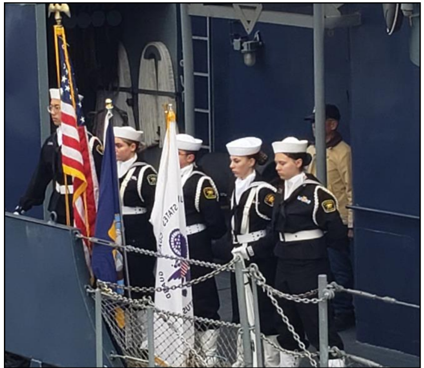
Sea Cadets from the Albany Division were present for