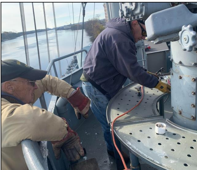
Work continues as we seal leaks on the flying bridge.