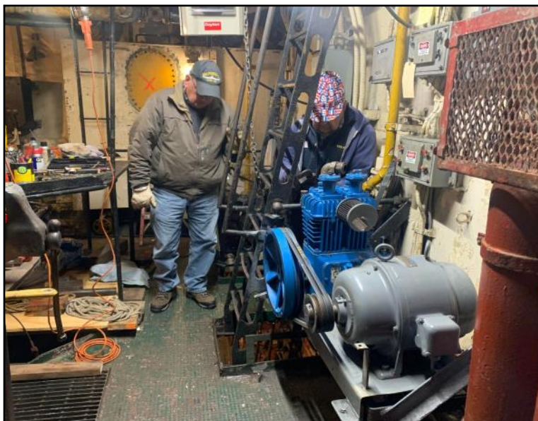
The new to us air compressor passed it's test run following overhaul.

Danny Statile completed the restoration of the aft three-inch gun ready service ammunition lockers. The steel in the bottom of the of the lockers and the supports was completely renewed, and all the brass ring dogs were restored and replaced. He is now fabricating a new watertight door for the forward end of the interior main deck passageway.