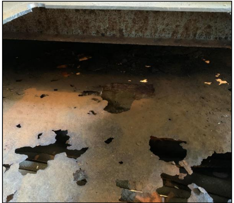
Here's what's left of the deck after scaling.

We replaced the bolted inspection cover temporarily. Later, we will drill out and replace the old bolts and nuts. On the flying bridge outside of the radar hut we have inspected perimeter weld, cleaned any rusted areas, and sealed leaks temporarily with roof tar coating. We also reinspected and sealed the perimeter of the hut area that is coated with tar/roof coating at the deck level to prevent rainwater from seeping in.