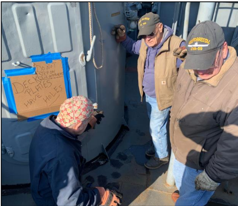
Sealing up the holes outside the radar shack.

hadn't budgeted for, showing how critical your donations are. We will then return all the artifacts to the chartroom and CIC and reset the display in these compartments for public display. Are you ready for that John?