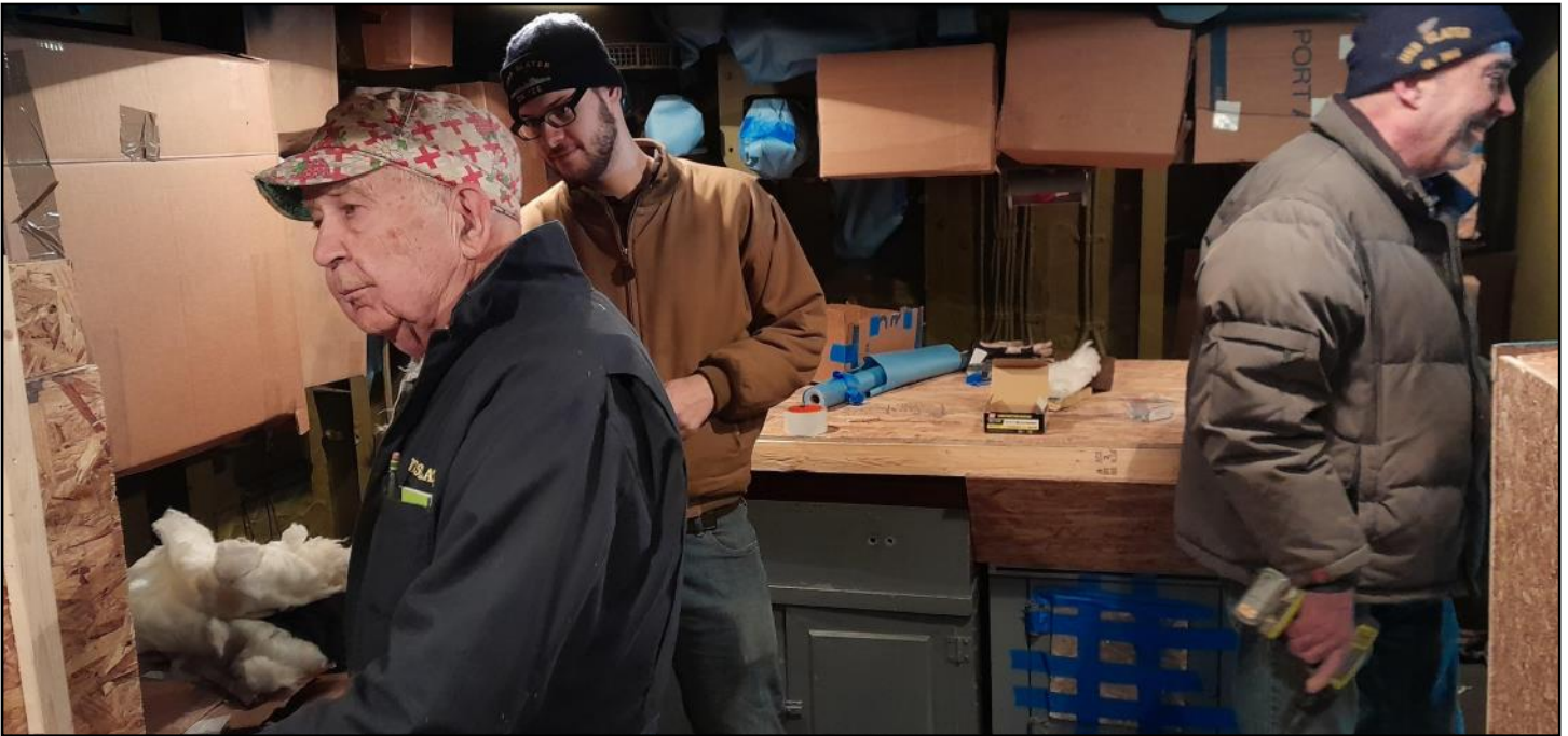
Covering the equipment in CIC.

retention clips as much as possible, without doing excessive grinding.